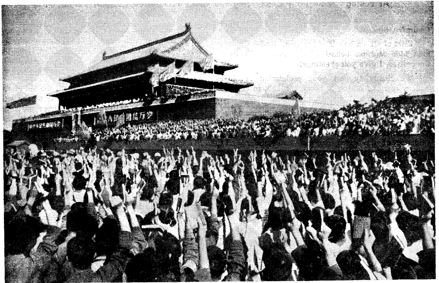
Raising their copies of Extracts From Chairman Mao's Works , young revolutionary fighters of the capital cheer: "Long live Chairman Mao!"