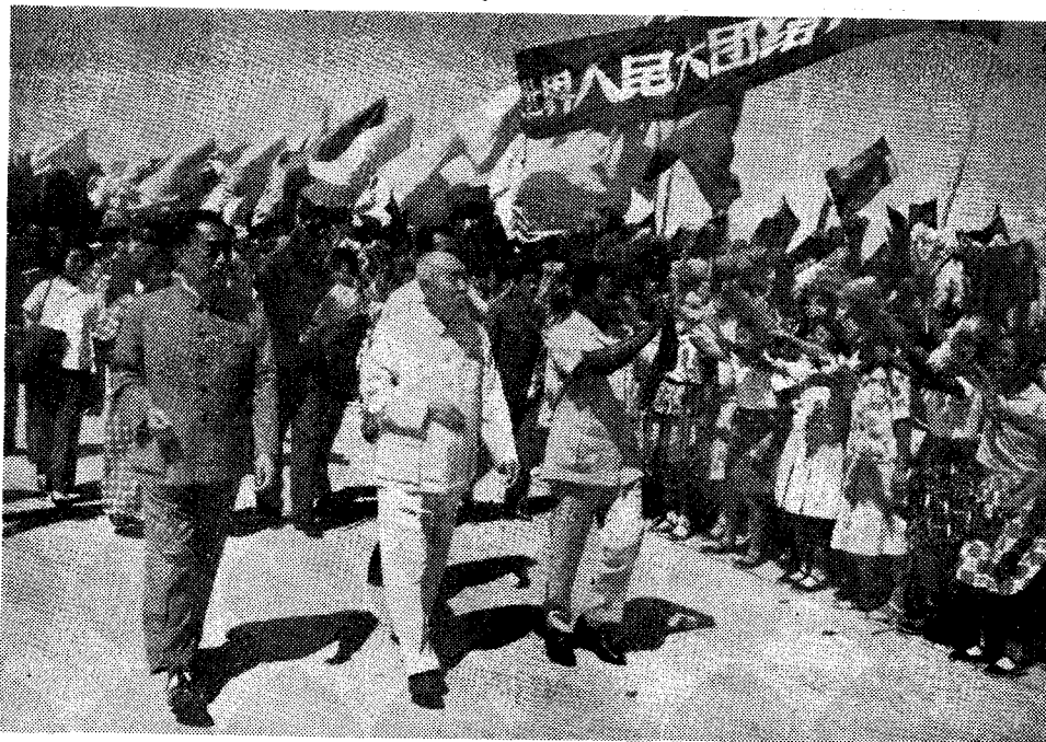
Accompanied by Vice-Chairman Tung Pi-wu and Premier Chou En-lai, Vice-President Kamanga and the other distinguished guests from Zambia receive a warm welcome from the crowds as they walk out of the airport

Premier Chou stressed that the anti-imperialist struggles of the Afro-Asian peoples had always supported and encouraged each other. The heroic Vietnamese people were standing in the forefront of the present anti-imperialist revolutionary struggles of the people of the world. The Vietnamese people's war against U.S. aggression and for national salvation was tying down and hitting at the largest of U.S. forces, and this constituted the greatest support to the peoples of other countries.