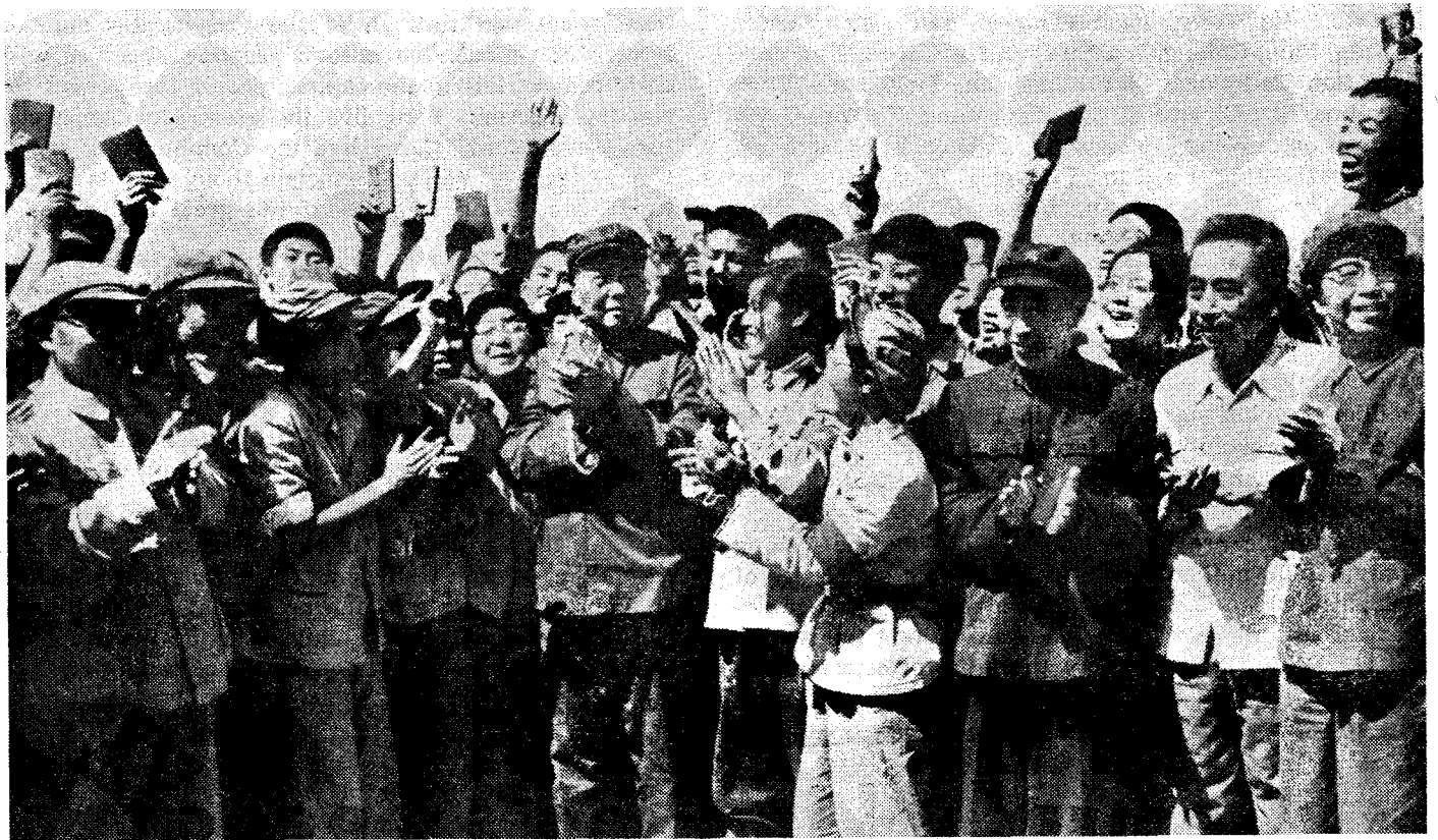
Chairman Mao and Comrades Lin Piao and Chou En-lai with members of the "Red Guards"