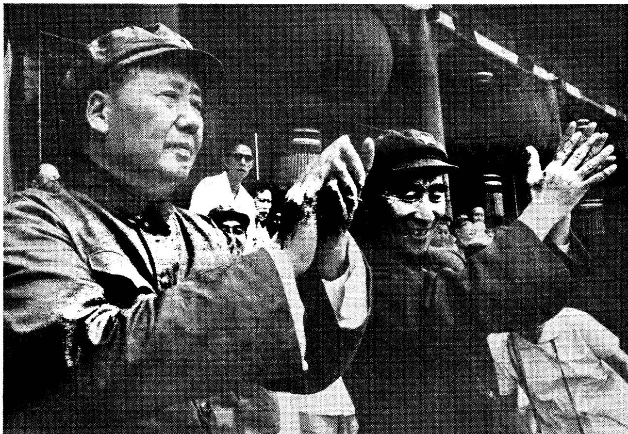
Chairman Mao and Comrade Lin Piao on the Tien An Men rostrum

ways fights together with us." Some remarked: "We are boundlessly happy to have such a supreme commander as Chairman Mao. We will always be his good fighters, follow him and make revolution for the rest of our lives."