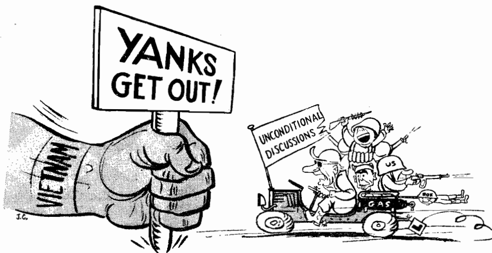
Johnson's Crash Course

The issue of war or peace on the Viet Nam question today hinges on whether the U.S. aggressors will get out of Viet Nam or not. The outcome of this struggle will not only have a bearing on the independence, reunification and peace of Viet Nam itself but on the interests of the revolutionary people throughout the world and of world peace. In this serious struggle, all peace-loving countries and peoples of the world must distinguish between right and wrong, between friend and foe, and unite and direct the spearhead of their struggle against the most vicious enemy of world peace,