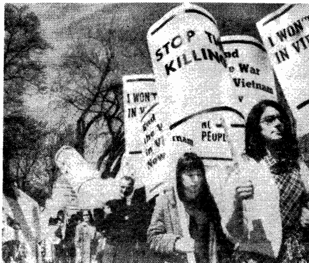
American college students demonstrate outside the White House

The fact that the American people have begun to raise their own voice louder than before shows that the band of common murderers that is the Johnson Administration is isolated. It shows, too, that the struggle in the United States is interlocked with the struggle of the Vietnamese people. In voicing their protest in Washington, New York or Johnson City, the American people are not only defending their own interests but are giving assistance to the heroic freedom fighters in south Viet Nam. Likewise, the people in south Viet Nam who are handing out punishment to the brutal invaders are striking blows not only for their own freedom but also for the American people who are battling against the monopolistic power structure at home.