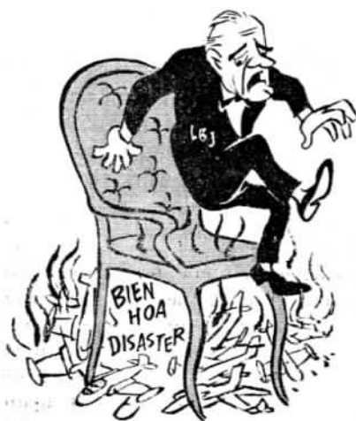
Tough times in south Viet Nam

Close on the heels of multimillionaire David Rockefeller's visit to