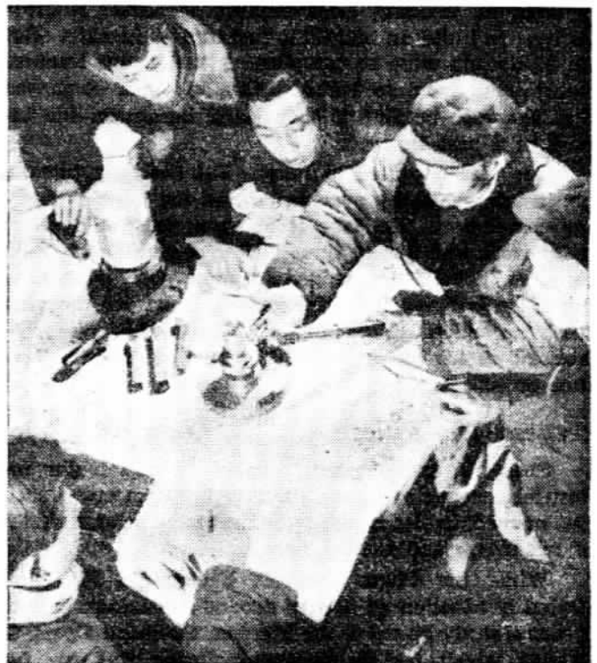
Wusih workers exchange know-how in local palace of culture

It was no easy task helping so many all at once. But Consolidated did a fine job. Interviewing the visitors one by one, they listed the problems awaiting