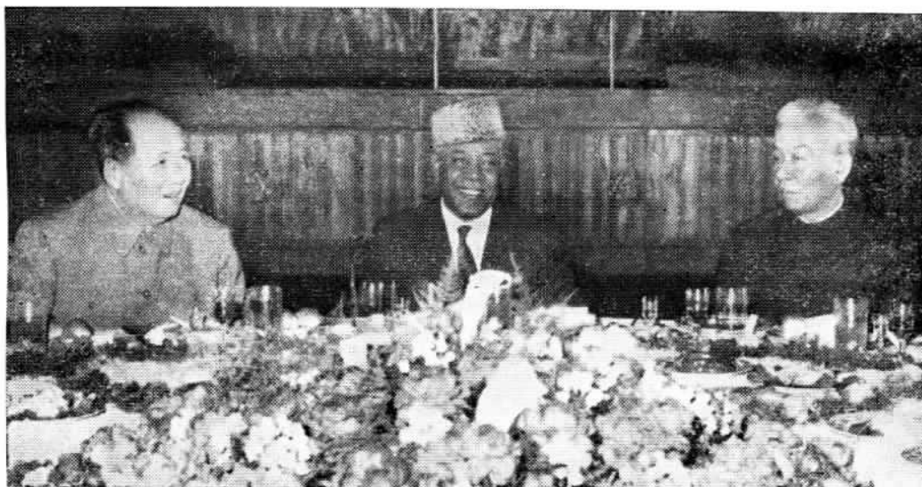
Chairman Mao, Chairman Liu and President Abboud at the banquet the latter gave in Peking

The successful talks President Abboud held with the Chinese leaders manifested Asian-African solidarity in the common cause of opposing imperialism. This was well described by Premier Chou En-lai at the banquet given by President Abboud on May 18 in Peking. The Premier said: "The leaders of China and the Sudan have held cordial and sincere talks on international questions of common concern and on the question of further strengthening and developing the relations of friendship and co-operation between the two countries. We have reached identical views on the questions discussed and will issue a joint communique.