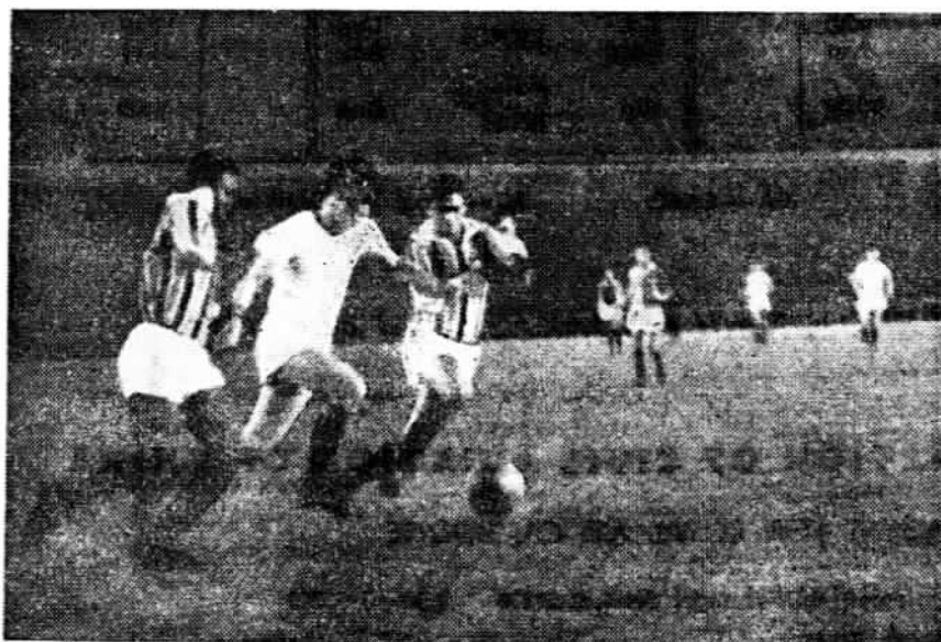
During the match between the Madureira team and the Peking XI

Seeds of Friendship. Close to a hundred different species of tropical plants of West Africa are growing lustily at the Botanical Gardens in Hsishuangpanna, Yunnan Province. Their seeds were presented to New China by their native countries. They include young tallow trees from Guinea, sugar-yielding "Desert Palms" and Miraculous Berry plants from Ghana, and Baobab or Monkey-Bread trees from the deserts of Mali. Most of these plants never before grew on Chinese soil.