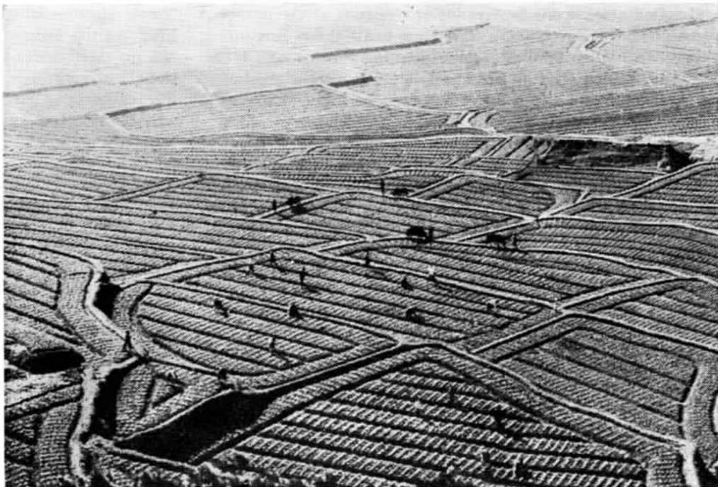
Meticulous farming in an east China people's commune

Animal husbandry too has been doing well since the beginning of this year. The number of cattle increased;