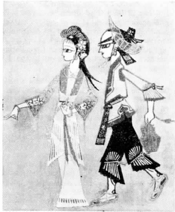
"The Golden Conch"

The film will present its theme in a fascinating world of cut-out fantasy. The scissor-cut style was adapted to the screen only in 1958 by Wan Kuchan, one of the three Wan brothers who pioneered the making of cartoon films in pre-liberation China. As it is today, it is a film derivative of the ordinary papercuts, which Chinese folk art developed centuries ago and which are still immensely popular as house decorations, and the traditional Chinese shadow play. The figures of the latter are made of cow or donkey hide and have articulated, moving limbs. For the animated film the cut-out figures are made of stiff paper and also have articulated limbs. Designs of both figures and sets draw on traditional papercut and shadow play forms. One recent release of the department in this medium is A Silken Girdle . This is a cautionary tale of olden times in which an industrious but poor old man picks up a silken waistband dropped by a rich man, spends his meagre savings on buying rich clothes to go with it, and forgets his work. His vain pretensions are pricked by the sober advice of