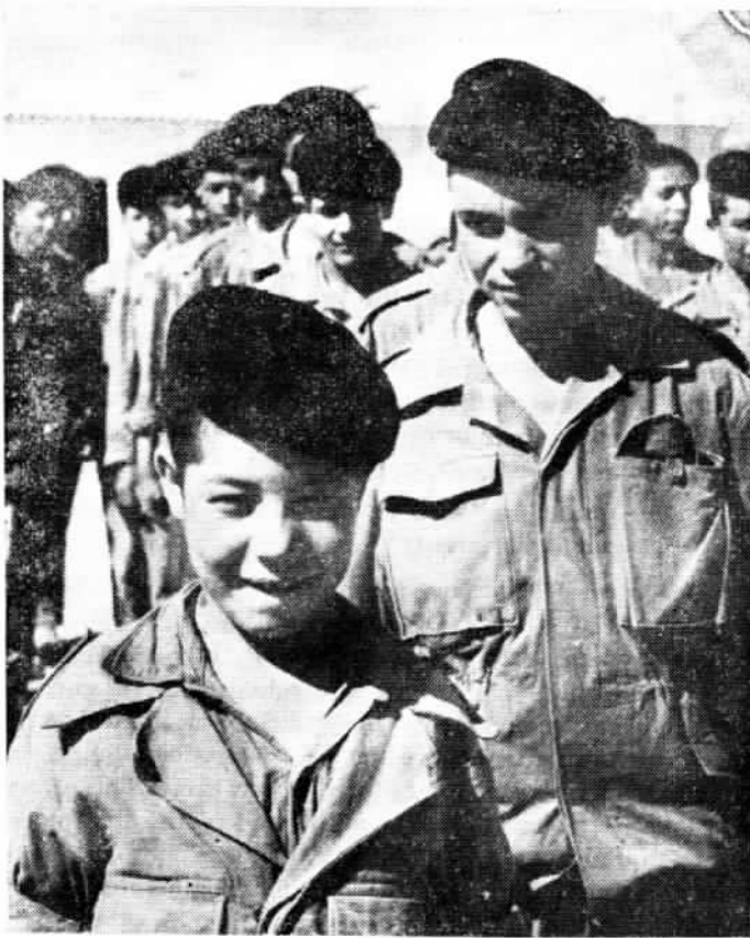
Children of patriot martyrs at school

pal Hall. It is now still under repair. The unpainted new wall of the building, the vacant windows, the steel reinforcing rods hanging down from the roof like icicles and the exposed hollow bricks—all are reminders of the days when these fascist beasts were rampant.