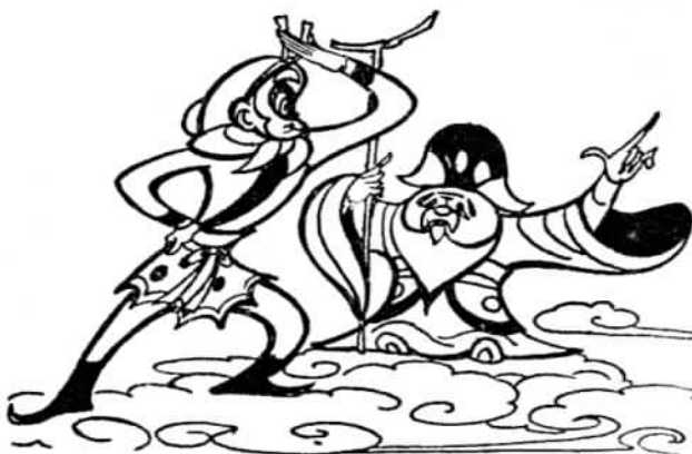
"Uproar in Heaven," Part II

Another follow-up to a successful first try is A Dream of Gold , a