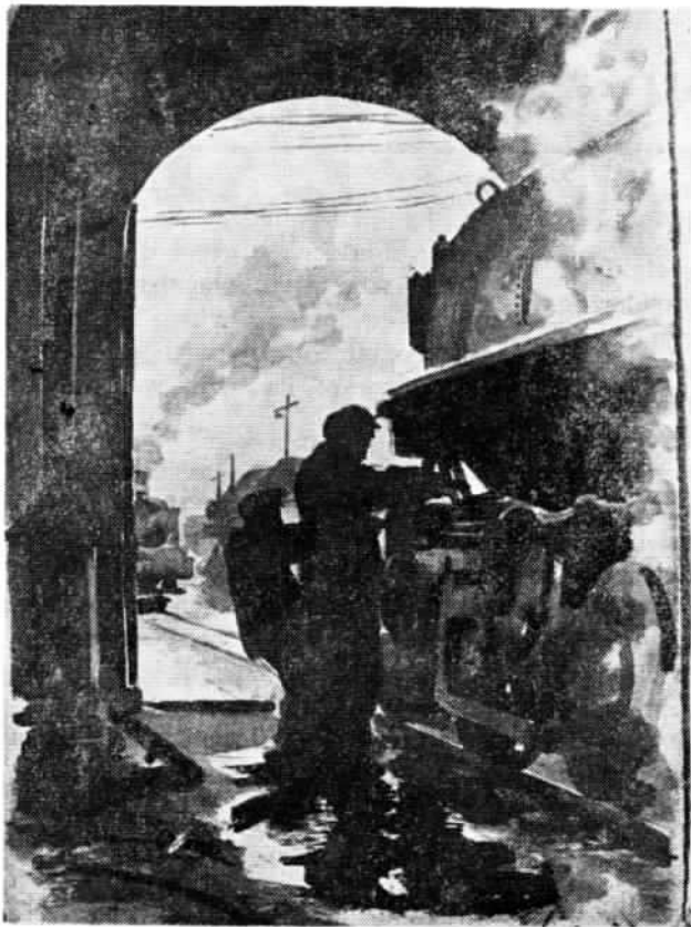
In the Repair Shop Watercolour by Liang Yu-lung

federation Tsai Chang, Vice-Presidents Teng Ying-chao, Li Teh-chuan, Hsu Kuang-ping, Yang Chih-hua and Liu Ching-yang were hosts to women guests from 27 countries and representatives of women from all walks of life in the capital. Among the foreign guests at the party were wives of diplomatic envoys, women experts and wives of experts helping in China's construction, guests now visiting the country and students studying in Peking. Vice-Premier Hsi Chung-hsun attended the party.