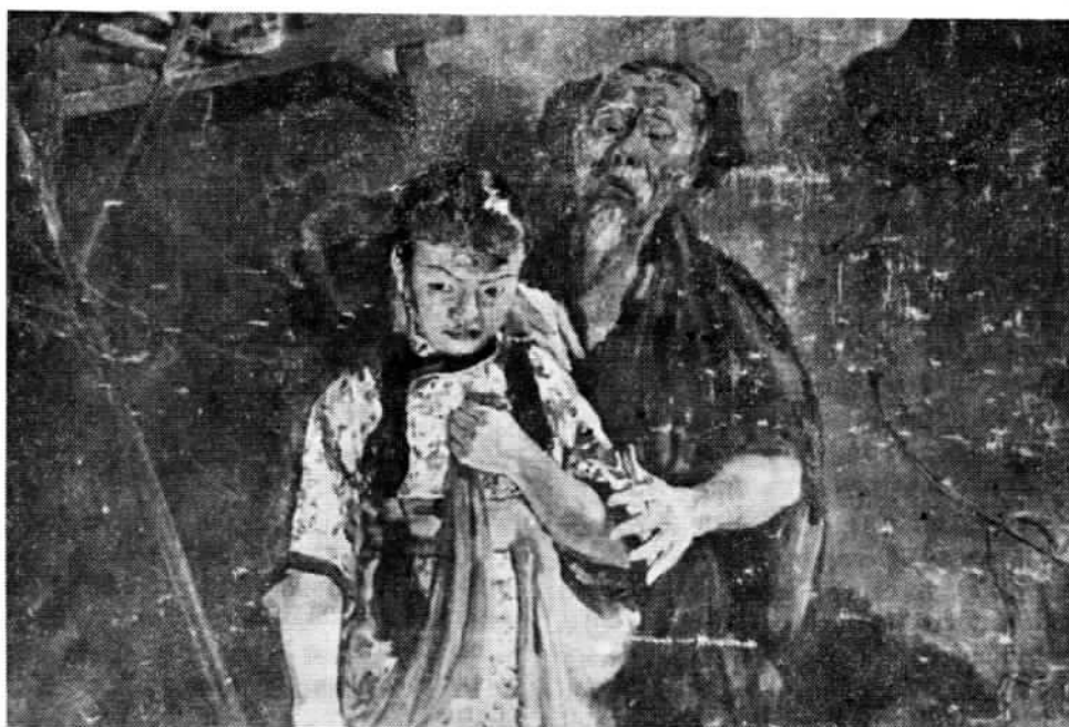
Put Down Your Whip