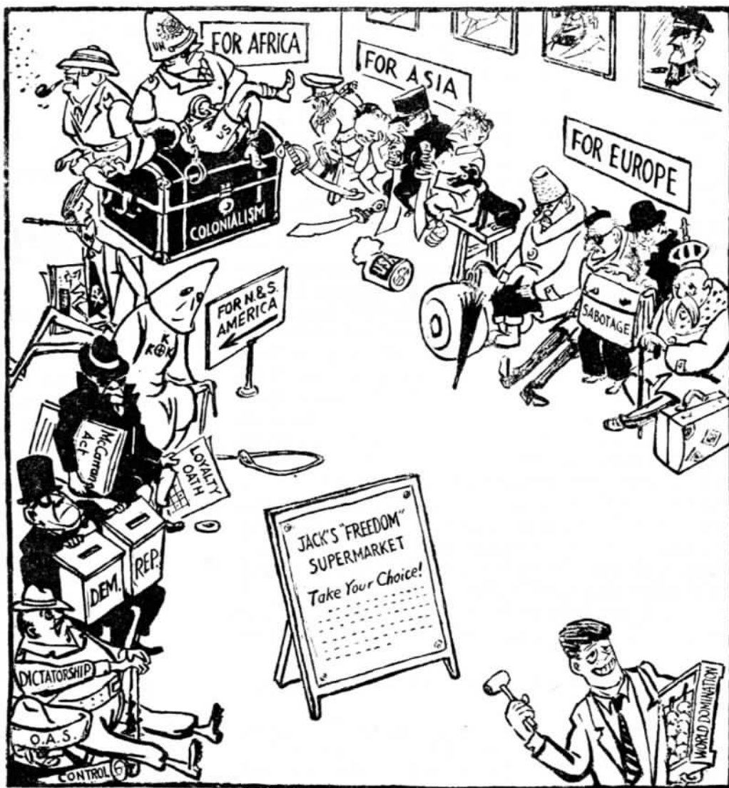
Kennedy, Salesman for U.S. "Freedoms"

In other words, what we're talking about here can be described as a milk shake down.