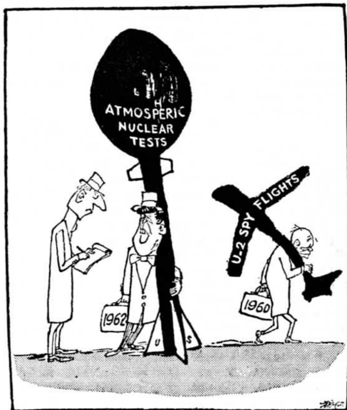
Kennedy: As usual, we are doing this to show the world our sincere desire for peace on the eve of East-West negotiations.

1. He declared that the United States would refrain from conducting nuclear tests only on condition that the