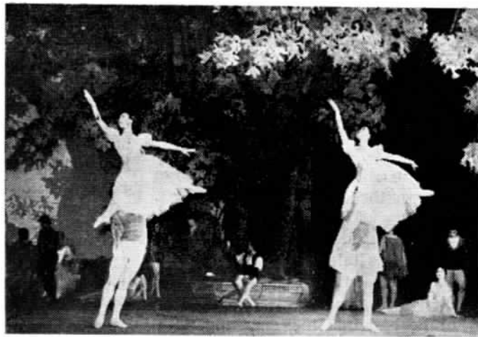
The Chinese ballet troupe's performance of Swan Lake in Rangoon. It has just concluded a 7-week tour of Burma

A new wing, built with Chinese economic aid at the Takeo College at Preah Outey in Cambodia, was opened by Prince Sihanouk recently. This is one of a number of Chinese aided projects built in Cambodia. Describ-