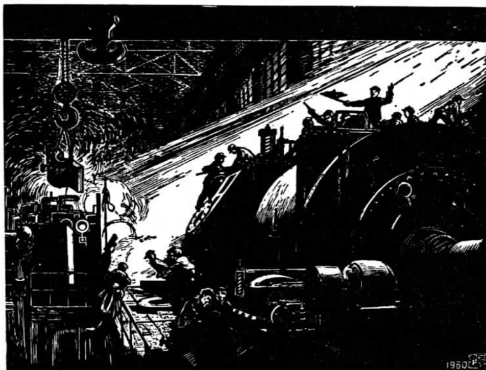
Installing a Generator

Mutual help between the city's engineering plants has made a big contribution to their joint success. When the Shenyang Compressor Works' representative, speaking at a meeting called by the city's engineering plants to co-ordinate their efforts, reported that it did not have enough equipment for quenching, i.e., rapid cooling, of crankshafts, the Shenyang Machinery Works readjusted its own production plan so that it could do this job for the Compressor Works. With this help, the latter was able to complete in time an urgent delivery of machines for the light and chemical fertilizer industries.