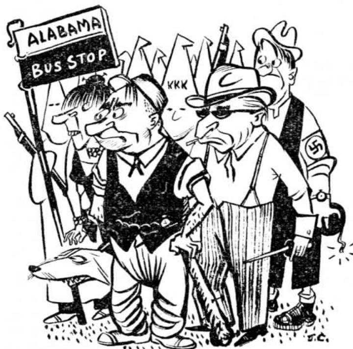
Waiting for the Freedom Riders

"I hope nothing happens to them before they get here."