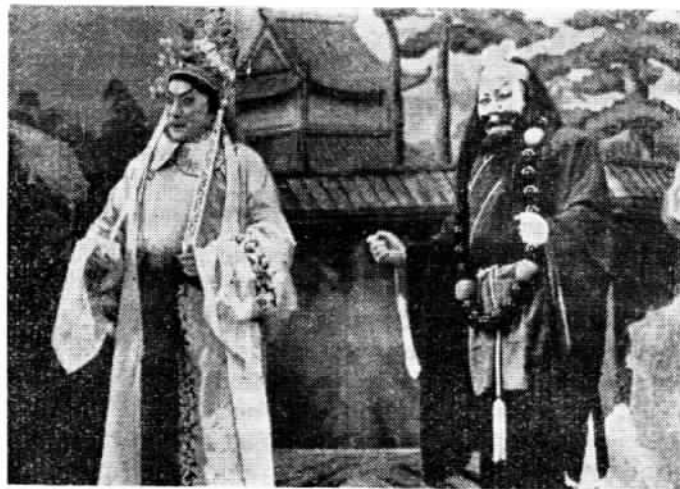
Chojuro Kawarasaki as Lin Chung and Kan'emon Nakamura as the Monk Lu in the "Kabuki" production of "Water Margin"

Water Margin , rooted deep in the soil of China, is flowering today in Japan. In response to the eager hopes of the Japanese people, our troupe is now planning to stage the sequel to Water Margin . Once again at the invitation of the Chinese People's Institute of Foreign Affairs and