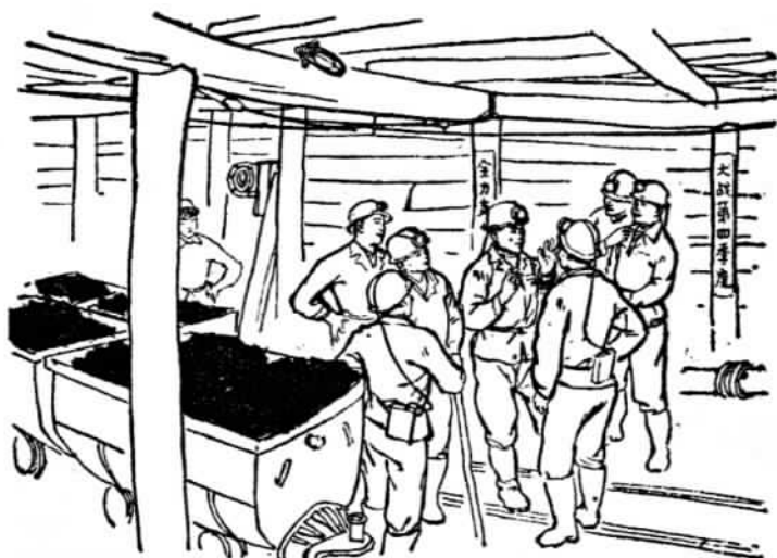
A Discussion Down the Pit