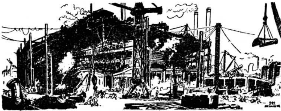
Building a New Factory