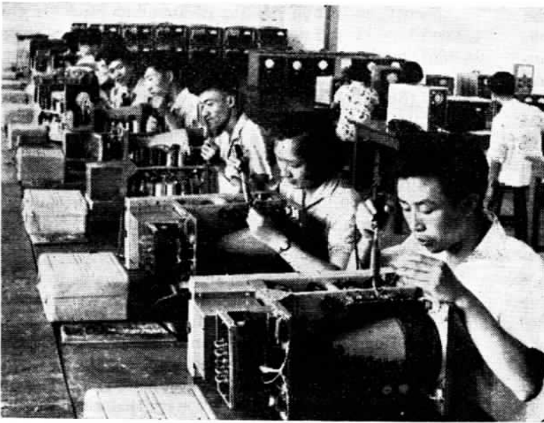
Tsinghua Students Making Pulse Oscillographs

as a preparatory secondary school for training students before they were sent to the United States for further education. Tsinghua, in other words, was planned by the United States as a base for the cultural penetration of China. Apologists for U.S. imperialism have, of course, not failed to describe the establishment of Tsinghua as a testimony to the "traditional friendship" of the United States for China. Former U.S. Secretary of State Dean Acheson, for one, said unctuously that the building of Tsinghua was one of the "many [U.S.] acts of good will over a period of many years. . . ."