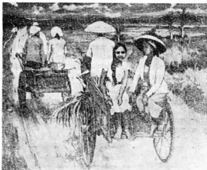
To the Bazaar

They deal too with other aspects of their life. Many works are devoted to themes of the people's struggle against imperialism. Here are guerilla fighters in the decisive operations against Dutch colonialism. Here are cartoons, in the style of comic allegories, satirizing the hypocrisy of Eisenhower and poking fun at Dulles' failure in instigating rebel groups to carry out subversive activities. Here too are first-hand sketches of the U.S. flier Pope sent to murder Indonesians from the air and now standing in the dock, and of mass demonstrations demanding the return of West Irian.