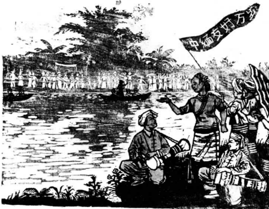
Festival on the Border — The Chinese and Burmese Peoples Rejoice Together

Another reason for the constant growth of the friendly relations between China and Burma, Premier Chou En-lai