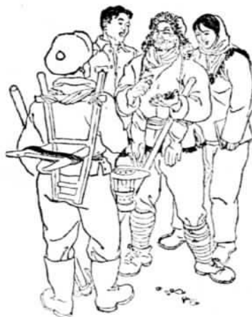
Learning from a veteran