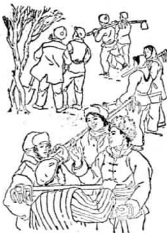
Townsperson on the farm