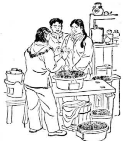
A commune laboratory