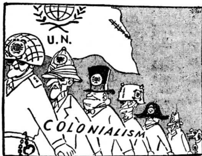
Special Detachment Under the U.N. Flag

In its criminal acts of aggression and intervention against the Congo, U.S. imperialism has once again used