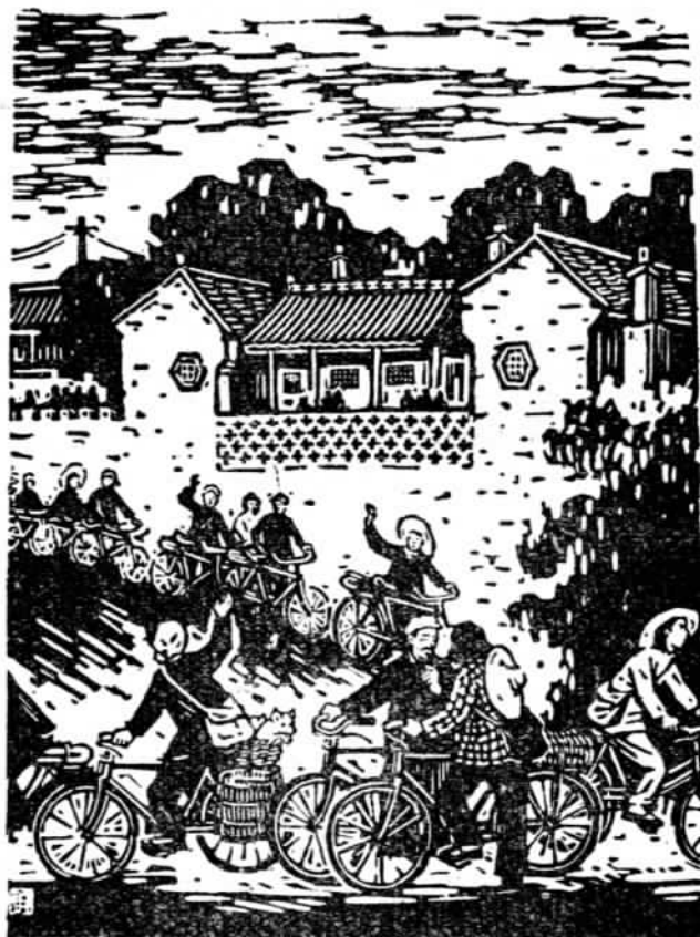
Rural Commune Cadres After a Meeting

Most of the works shown portray the deep-going changes taking place in the