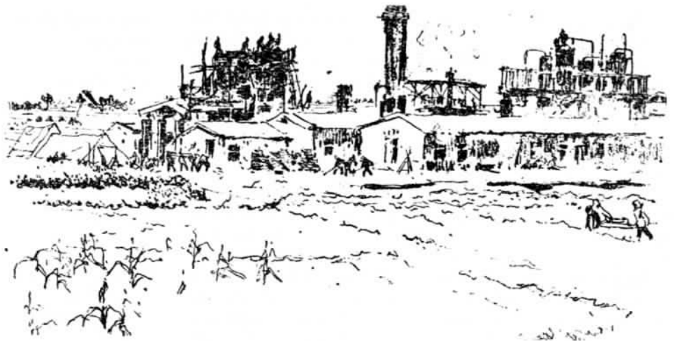
Chemical Plant in a Rural People's Commune

It was the big leap in 1958 and the establishment of the rural people's communes that marked the start of a regular spurt in the production of chemicals by the masses and the building of commune plants to turn out chemical fertilizers, insecticides and other chemical products by indigenous methods. A further big development of small chemical plants came with the upsurge in