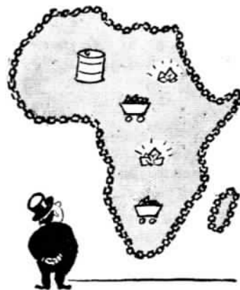
In his dreams . . .

Who dares imply that my imperialism stinks?