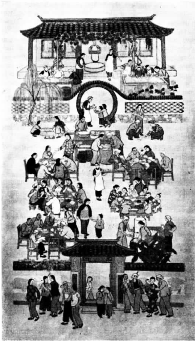
A commune dining-room

A joint work in Chinese ink and colours by graduates of the Central Institute of Fine Arts