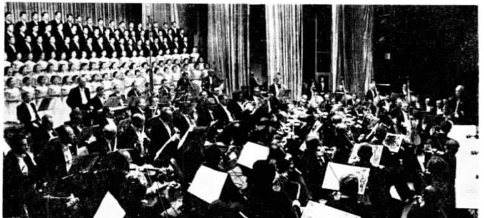
A joint performance of Beethoven's Ninth Symphony by the Dresden Philharmonic Symphony Orchestra and a Chinese Chorus