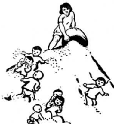
Piling up the harvest

Thanks to strong leadership of the Communist Party and the people's communes, as soon as the first signs of drought appeared seven million people were mobilized to fight it. 140,000 cadres of the province, from the secretaries of the provincial Communist Party committee down, left their offices and carried water to the fields. The province's transport, industrial, commercial and public health departments all helped the battle to the best of their abilities. The slogan of the stubborn Hupei people "We fight wherever there is a drought, we struggle as long as the drought lasts!" rang throughout the length and breadth of the province. Ignoring the scorching