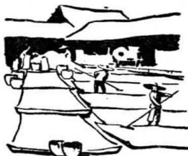
In the yard