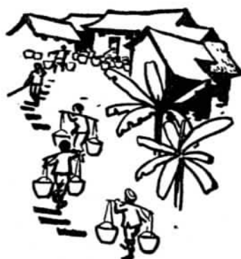
To the granary