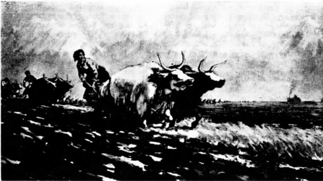
The people till their own land in Tibet