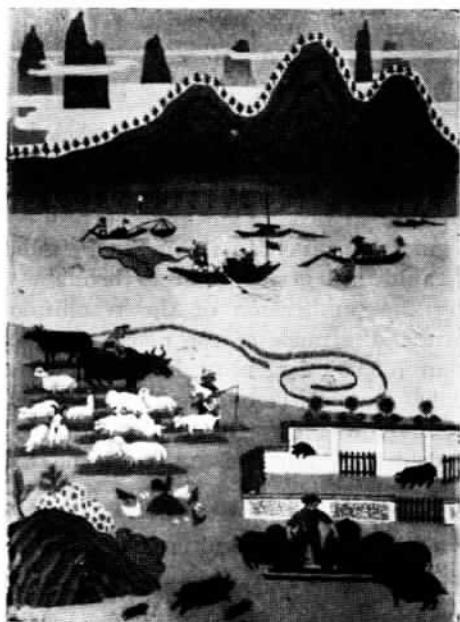
This artist's view of a people's commune graphically depicts the combination of agriculture, forestry, animal husbandry, fishery and side-occupations which is a distinguishing characteristic of the diversified economy of the communes

Many communes are still waging the fight against the drought, which has