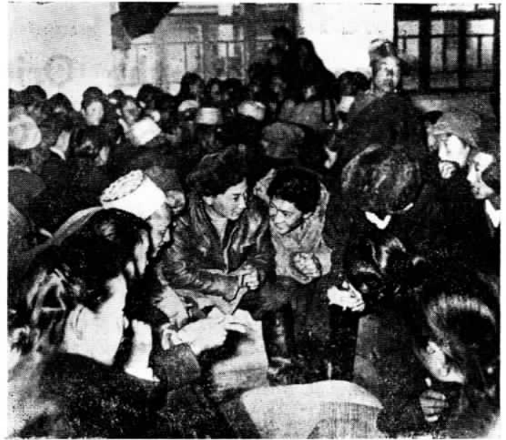
Young Tibetans and Huis in Lhasa discussing the Order of the State Council

Meanwhile, more eminent Buddhist leaders in other parts of the country, and especially in the provinces adjoining Tibet which have large numbers of Tibetans, have unmasked the rebels in Tibet who misused religion for their own vicious ends. Suffice it to cite but two statements by Buddhists in Szechuan Province, east of Tibet.