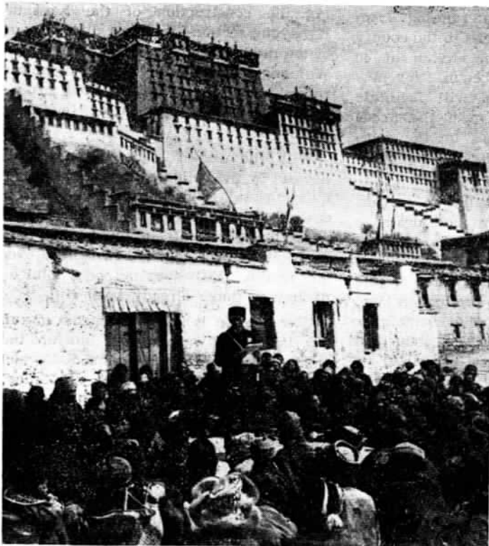
Explaining the policy of the Central People's Government

Only two weeks earlier the legendary Norbu Lingka and Potala Palace, which towers above the city, were occupied by the rebels. Now Lhasa is rid of rebels and breathes freely once again. The willow groves in the Norbu Lingka have donned their spring green and the Potala Palace, with its golden rooftops, glistens peacefully in the sun. The Military Control Commission in Lhasa, since its inception, has been providing help to people seeking work, and giving economic assistance to those in need who suffered at the hands of the armed rebels. Relief grain has been distributed to more than 1,000 people and work has been found for some 400. In this atmosphere of restored peace, traditional Tibetan life and spring hope, the Preparatory Committee for the Autonomous Region