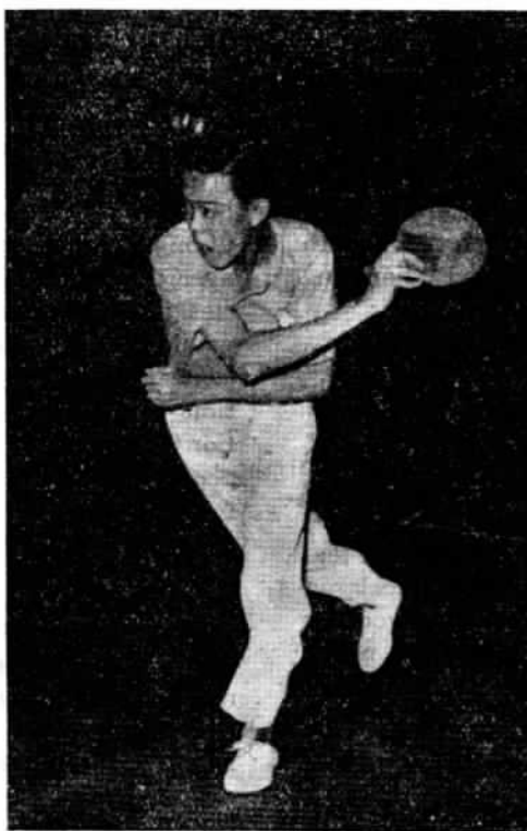
Jung Kuo-tuan in action

The successes scored in Dortmund augurs well for the future. The Chinese players have made rapid and remarkable progress, but they still have much to learn from their colleagues in other countries. As Jung Kuo-tuan said after his victory, "Though I've won the world championship, I'm still young and have much to learn from others. I must continue to improve my technique so as to win greater victories for my country." China's sportsmen are looking forward to 1961 when the 26th World Table Tennis Championships will be held in Peking. This will be a great opportunity for them to watch and to learn from top-ranking players from all parts of the world.