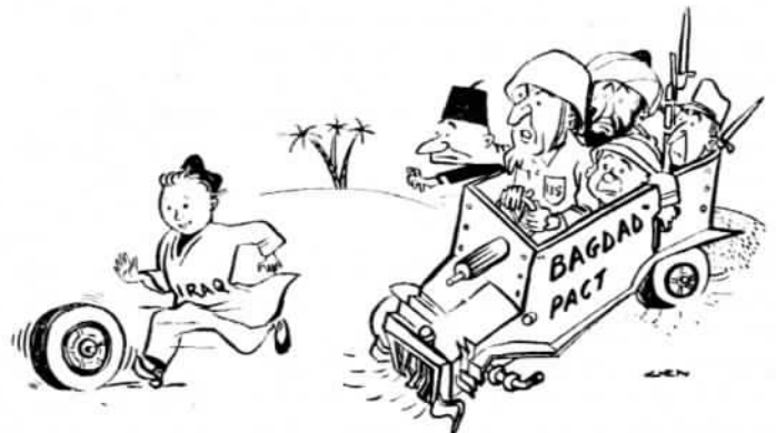
By Jack Chen

It is only natural that as a signatory to the Geneva agreements and a neighbour of Laos, the Chinese people are particularly interested in peace in Indo-China, Commentator states. Radio Vientiane recently distorted the efforts of the Chinese people to defend the Geneva agreements as "interference" in Laos' internal affairs. "This cannot but arouse the indignation of the Chinese people," Commentator stresses. "In foreign rela-