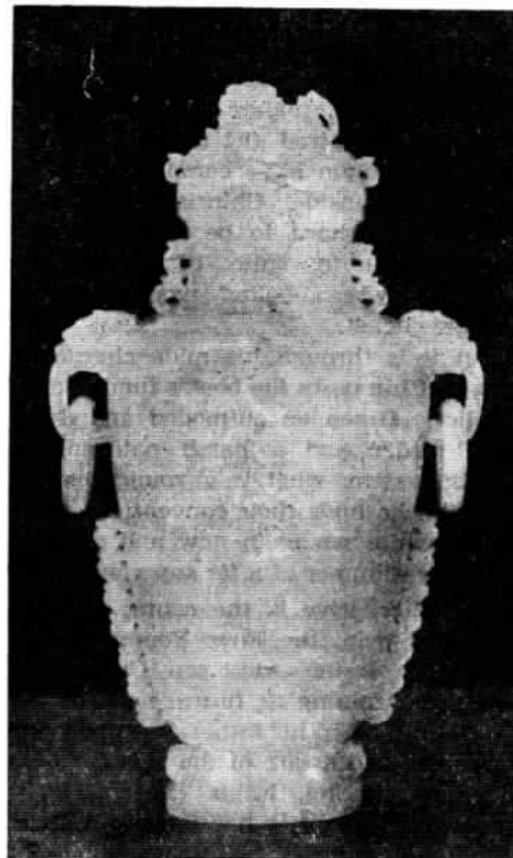
A white jade vase from the Peking Jade Carvings Factory

But a feature of modern carvings is the increasing use of themes taken from