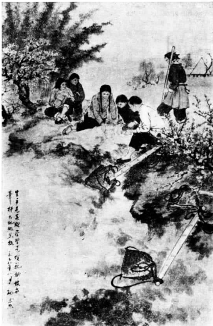
Studying in the fields

Painting in Chinese ink and colour by Wei Tzu-hsi