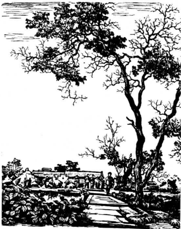
The village school