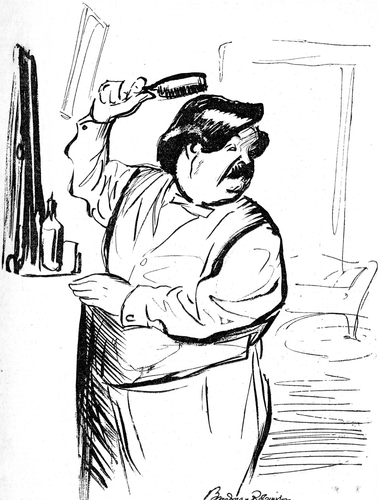
Senator Lorimer—And don't forget a dozen clean handkerchiefs. I'm going to give 'em some more of my early struggles.