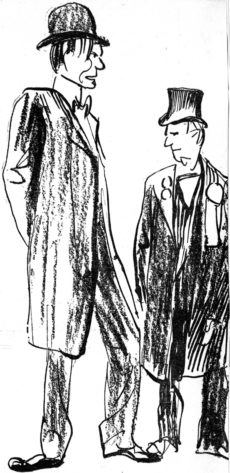
THE HON. BILL SULZER AND OUR UNKNOWN STATESMAN. IN SUITABLE HOT WEATHER ATTIRE