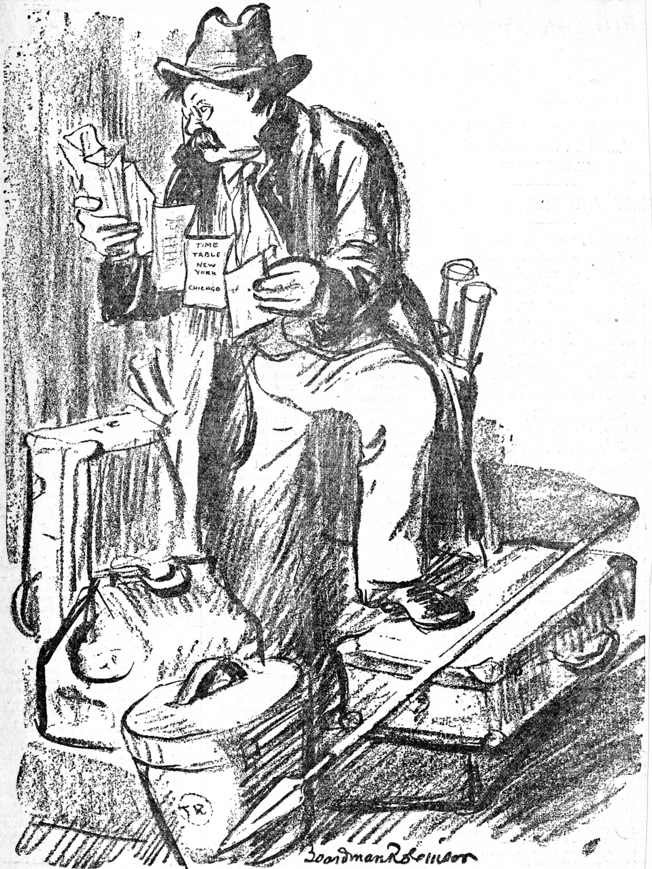
"I do not expect to go to Chicago."