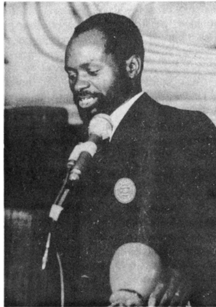
President Samora addressing the O.A.U. Summit

In 10 years of people's war, under the leadership of FRELIMO, the determined and united people of Mozambique have