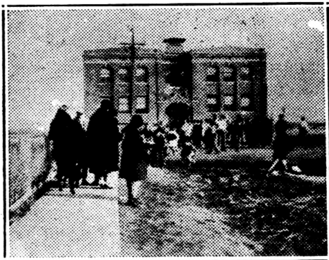
Workers Children Leave School in Frederick, Colorado.