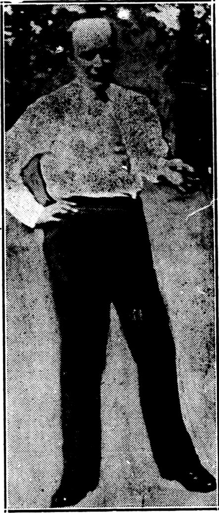
born July 9, 1882. Died March 2, 1927.

...of the old socialist when the Socialist... real working class... who really... the Communist Party.