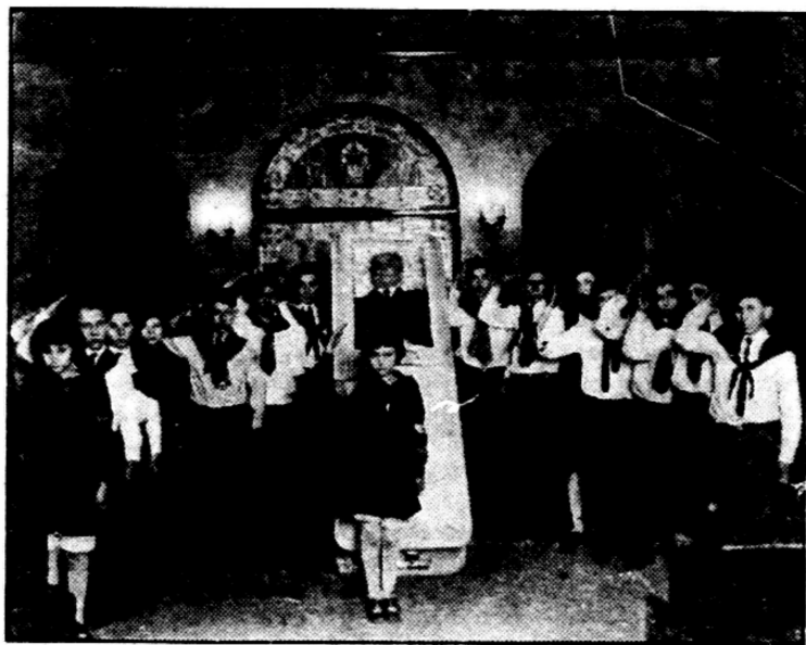
PIONEERS SALUTE THEIR GREAT LEADER FOR THE LAST TIME!

When he was about to die and knew that he would soon be no more, Comrade Ruthenberg gave his Last Message for us: CLOSE YOUR RANKS! WE WILL WIN! FIGHT ON!