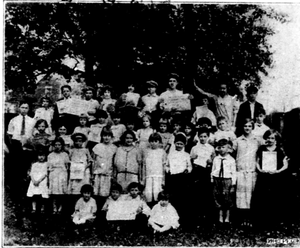
Chicago Juniors and Their Leaders

We will have our speakers. We will unite our International Children's Week with International Youth Day. The end of International Children's Week is the beginning of capitalist mobilization week. The capitalists are going to show their military strength to the world. They are going to show off the navy and the army. They are going to show off the state troops and the militia. And last but