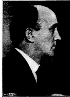
Wm. Z. Foster

We know that most of the American workers are a bunch of sleepy heads. They refuse to open their eyes and see the things that are tak-