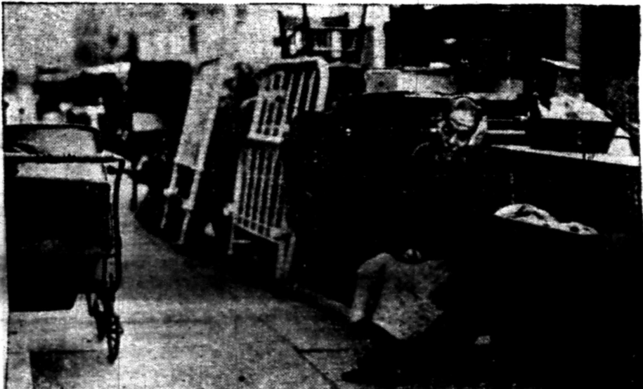
Thrown out in the streets—no job means no rent.

Communist Party Leads Workers in Fight Against Unemployment