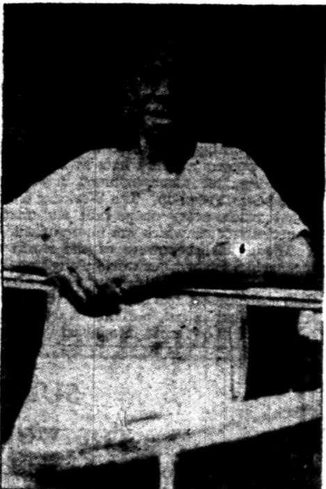
Tobacco Worker at Winston Salem, N. C. Her wage was $9.90 a week, until she was discharged for being a union member.

government? The U. S. government represents not the workers, but the bosses of this country. Its function is to keep the workers down and make it possible for the bosses to get more and more profits out of them.