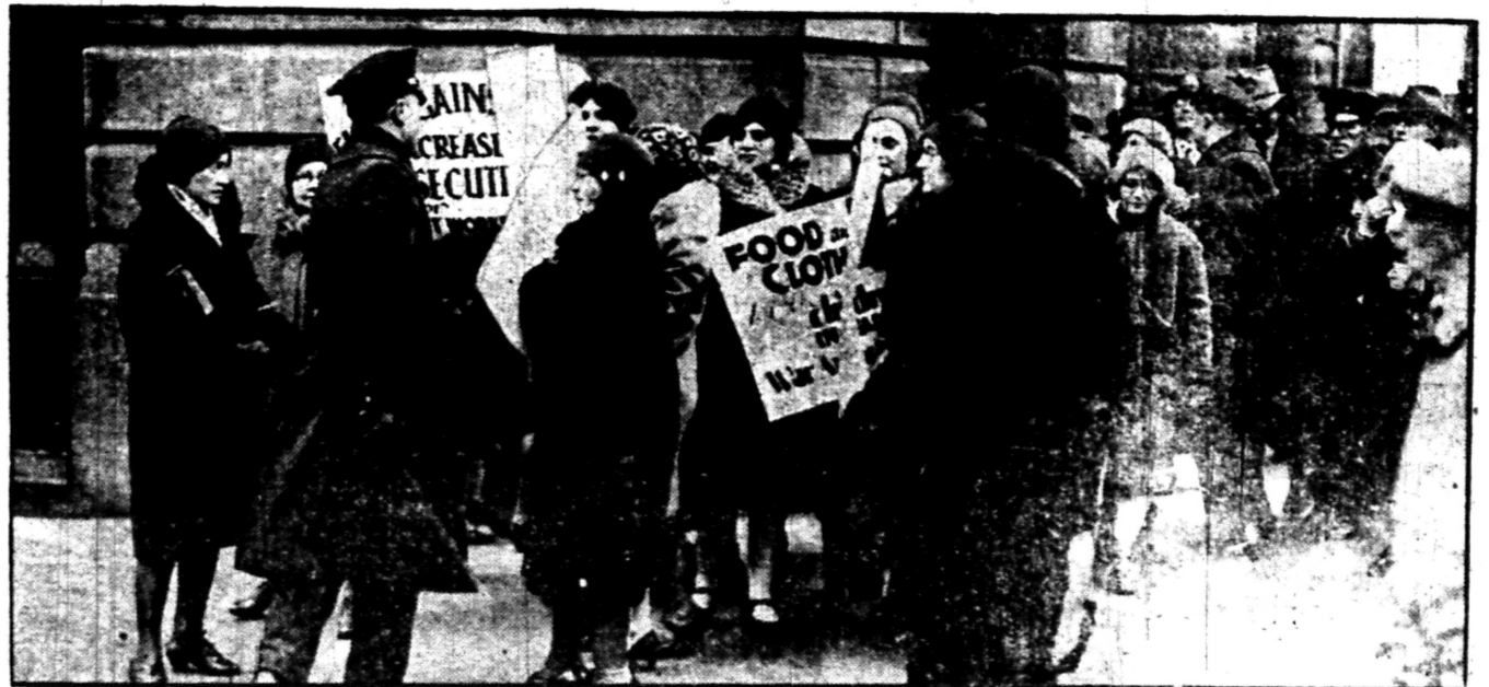
At the call of the Communist Party, working women of New York picket the Women's Trade Union League—exposing its treacherous role in the fake conference of the Cause and Cure of War, called by bourgeois women's organizations.