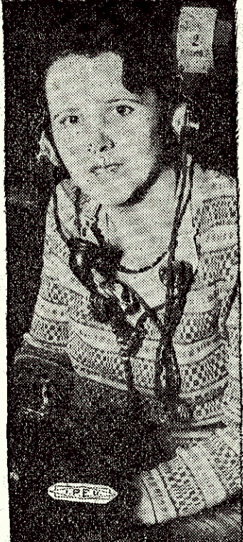
Sitting at her typewriter and getting the dots and dashes through her earphones, this girl is one of Moscow's telegraph operators.