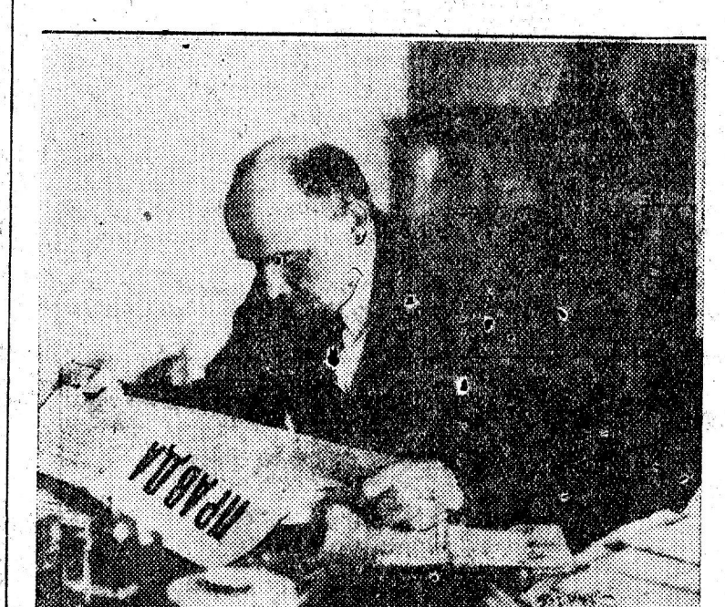
Founded Communist International, continued where Marx left off. Seen reading 'Pravda,' Soviet Party Daily.

reasoning a revolutionary weapon in the hands of the workers.