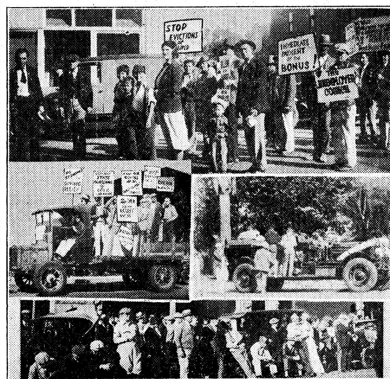
Scenes during the Santa Cruz County Hunger March. Top—Arriving at mobilization meeting. Middle left, part of Watsonville delegation. Right—Police with firehose ready to break up park meeting at Watsonville, when firemen refused. Lower—Part of crowd awaiting delegation's report.