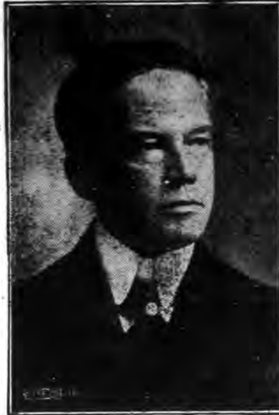
Charles Edward Russell

"The reason why I advise all persons that believe in a free press to support Pearson's Magazine is because Pear- son's is the only great magazine that is free."