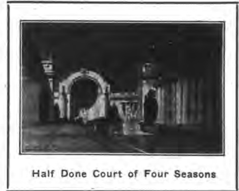
Half Done Court of Four Seasons

In the Department of Education there will be a comparative exhibit of the educational system employed by each participating nation and a graphic demonstration of educational work in all of its phases in the United States, from kindergarten to university, including a model school-room and moving picture hall with