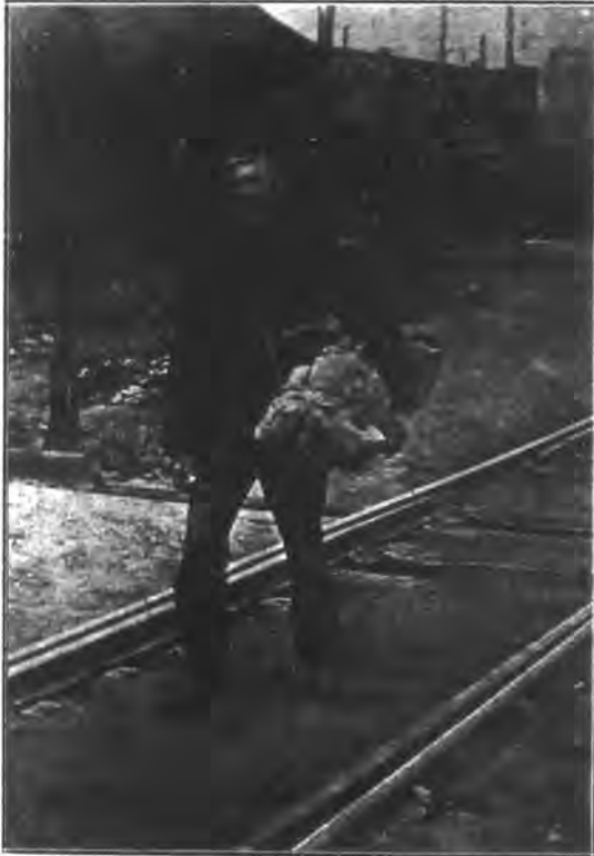
It's a Long Way to Tipperary or Any Other Point Where There Is a Job for This Weary Blanket Stiff

With no new worlds to conquer, what will he do now? Is he to be merely flotsam and jetsam, only a trench-filler for us to walk over to a higher civilization, or is he the Soldier of the Ultimate Good? Is he the un-couth Robert of "The Servant in the House?"