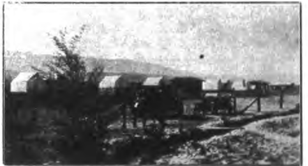
A glimpse at some of the temporary houses at Llano del Rio

Hot rivalry exists between the two leading baseball organizations which go under the names of "Headquarters" and "Hotel" teams. Their Sunday games are largely attended and new talent is eagerly sought. New recruits are frequently described in some such manner as "Mr. Blank is a plumber, single, 22 years of age, plays the slide trombone and third base."