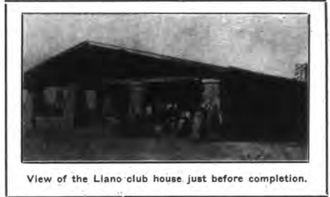
View of the Llano club house just before completion.

Horace and Frank Farmer broke their own records