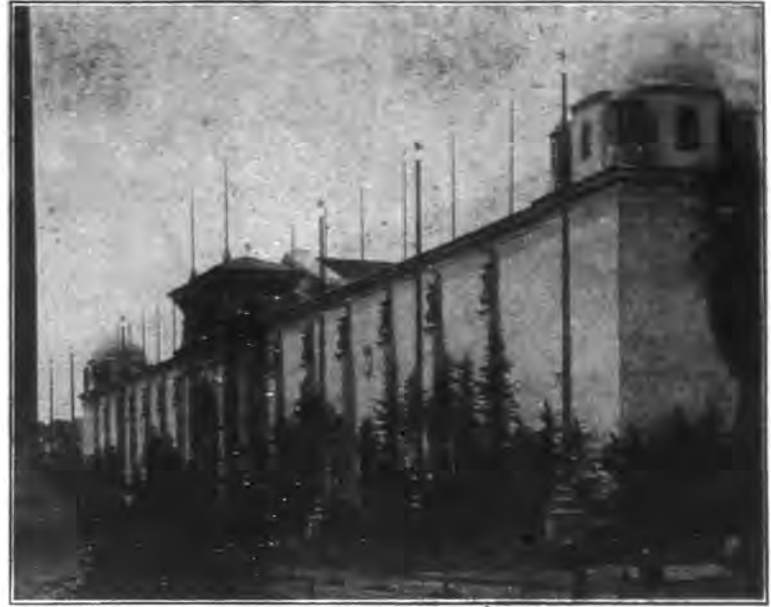
Palace of Varied Industries

In this connection it may not be amiss to hope that the exhibit will also explain how the Ford philanthropy came to be exercised in that particular direction, inasmuch as the credit for conceiving it is not unanimously awarded to Mr. Ford, but is given to his wife by many people, especially of the gentler sex, and neither he nor she has seen fit to settle the mooted question. The story which femininity prefers to believe—and repeat—is that Mr. and Mrs. Ford, being plain folk, were somewhat embarrassed by their rapid piling up of wealth until the lady devised the means of relief which her husband put into execution by allowing each of his workmen a liberal percentage of the factory's profits after all wages and other expenses are paid, and that the recipients of the extra compensation know to whom they are primarily indebted for it and have manifested their appreciation by turning out better machines and more of them