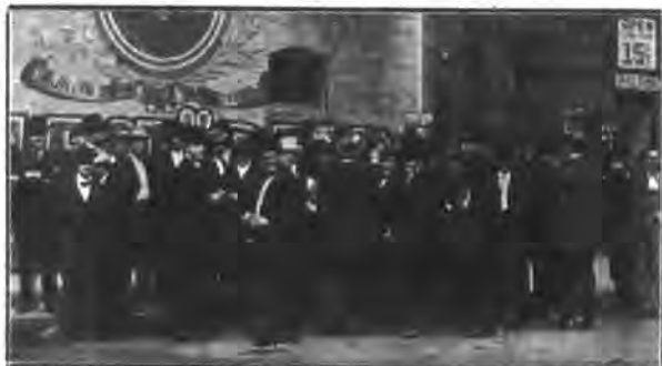
A different type has appeared in the groups of disemployed that eagerly crowd around the bulletins at the employment agencies. The clerk and bookkeeper and counter salesman with white collar and johnny hat, rubs elbows with he of the bundle stick and flat wheel.

So he must be an outcast, a pariah as often as not of refinement and culture and radiant personality, a relief from the conventionally molded, a living refutation of the hope that the education and the train-