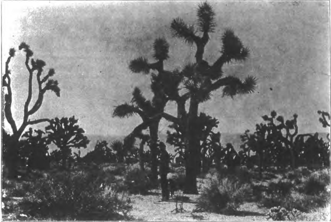
Giant Yuccas, "Joshua" Trees Taken in the Antelope Valley 20 Years Ago