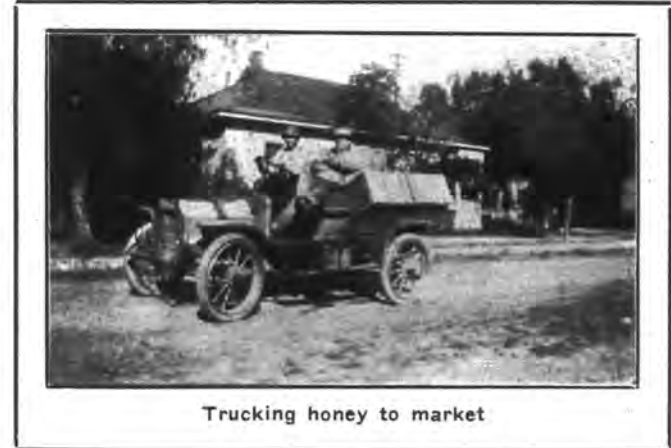
Trucking honey to market

With myriad wild flowers in the spring, a steady growth of sage and the proximity of the colony orchards, and hundreds of acres of blooming alfalfa, the llano is an ideal location for the business of production