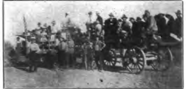
Colonists starting to the polling place on election day

The Saturday night dance has grown to be a popular fixture and the social life in the colony has devel-