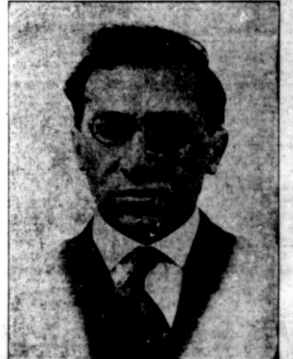
Italian Band of Twenty-Two From Grand Crossing to Play at Picnic.

Enthusiasm is growing as the Labor Press Picnic of August 26 is drawing near. It is expected that the largest gathering of workers ever assembled together at a Workers' Party entertainment in Chicago will be in Riverview Park on August 26. The park is famous as a picnic ground and with the program prepared by the arrangements committee nothing is wanting to make August 26 a day to be remembered by workers of Chicago. Each ticket entitles the purchaser to twenty-five five cent copy which will admit one to any many side shows with a small stall out. A popularly contest is one principal features of the picnic. Together with excellent music, dancing, singing, games, eloquence of M. J. Olgin, poet and orator, August 26 a day to be remembered by workers of Chicago. Foreign Language Federations of the broadest masses of workers exploited farmers. The English Daily will give a new impetus to the AMALGAMATION Movement. The English Daily will be the spiritual center of the Labor Party Movement. The English Daily will carry the slogan of the WORKERS' AND FARMERS' GOVERNMENT to the C. E. RUTHENBERG.