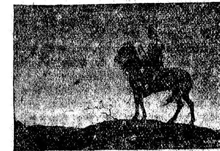
"The Cossack in America," by Art Young

Two remarkable photographs of Robert Smillie, the great British Labor Leader, and his message of greeting to the workers of America.