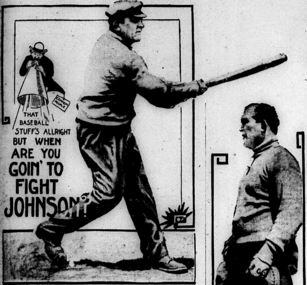
HE'S AT HOME WHEN FACING A PITCHER.

CHICAGO, May 27.—As part of the preliminary work which he calculates will bring his weight down to the point where he can begin actual training for his fight with Jack Johnson, Jim Jeffries spends considerable time each day playing ball with the White Sox.