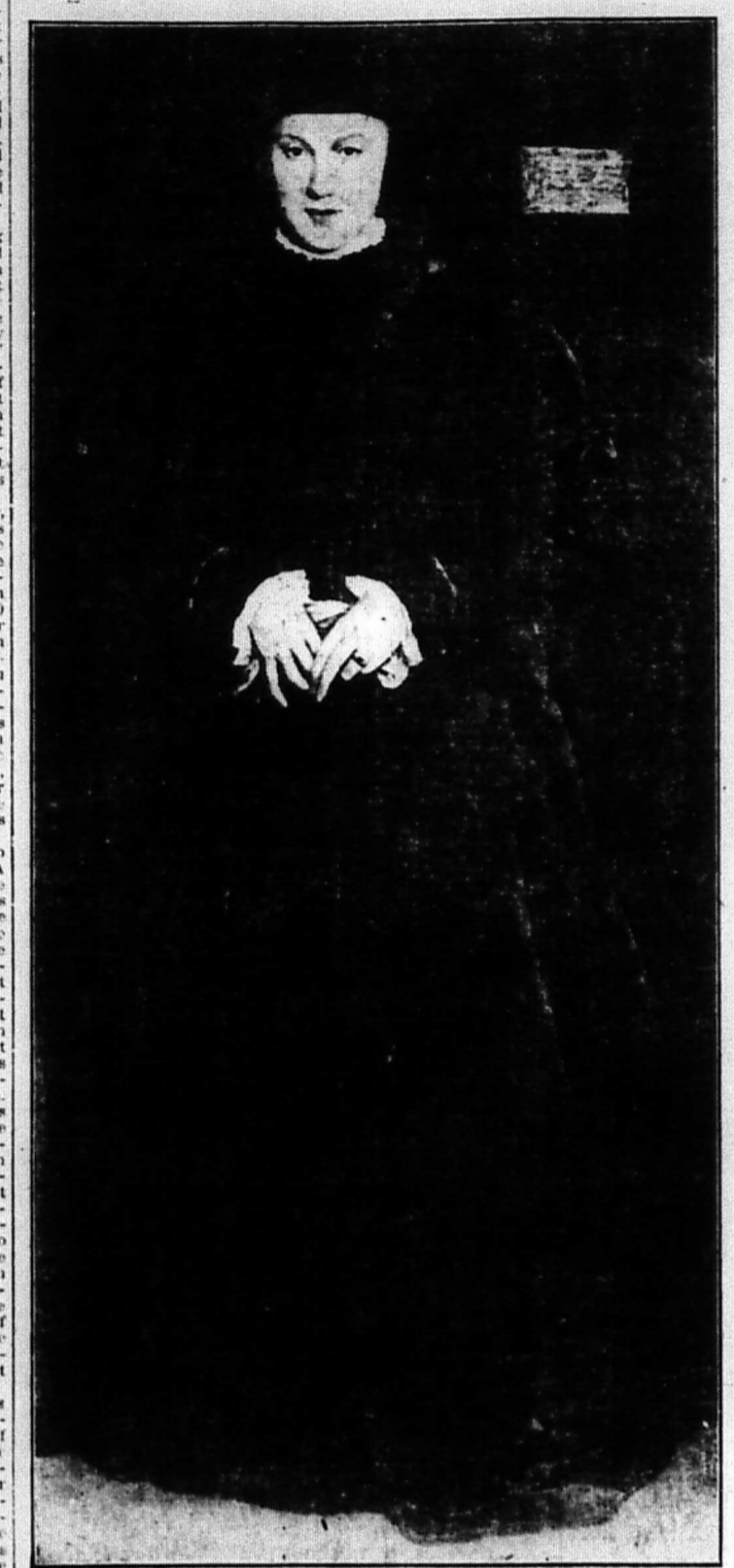
CHRISTINA OF DENMARK. The famous portrait by Hans Holbein, for which a firm of picture dealers has paid $350,000.

This masterpiece, which has been on exhibition at the National Academy at London for several years, was sold recently by its owner, the Duke of Norfolk, and it is reported that it may soon find an American purchaser if the National Gallery does not buy it. One writer gives the following account of it: