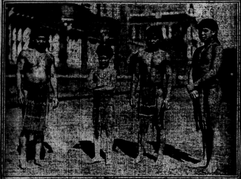
When the thirty-six or more runners start in the international six day race...