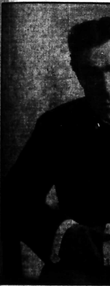
MR. WILLIAM FAVERSHAM. Now Appearing in "The World and His Wife" at Daly's Theater.