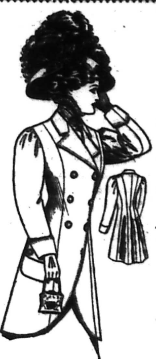
LADIES' TIGHT-FITTING COAT. Paris Pattern No. 3683. All Seams Allowed.

Smooth faced black broadcloth has been used for this model, which is particularly serviceable for a separate coat to wear over the dress of shawl or tweed. It is also an excellent model for the coat of the suit of corduroy or velveteen, as well as for those of Venetian cloth. The long side-front seams give excellent lines to the figure, while the innumerable seams at the sides and back all curve in sharply at the waist-line. The vent is unusually long, and the full-length sleeves are finished with turn-back cuffs of the material. The double-breasted front is fastened with buttons covered with the cloth in the center and having metal rims; these are of course made to order. Large patch pockets ornamented with buttons trim either side. The notched collar and revers are strongly attached to match the cuffs. The pattern is in 7 sizes—36 to 44 inches bust measure. For 40 bust the coat requires 3 1/2 yards of material 36 inches wide, 4 1/2 yards 38 inches wide, 5 1/2 yards 40 inches wide, or 7 1/2 yards 44 inches wide. Price of pattern, 10 cents.