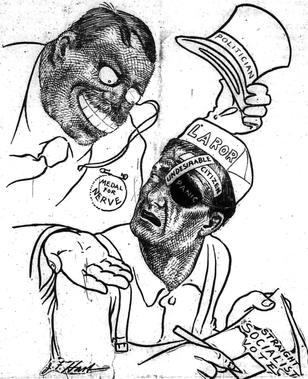
HE'S MIGHTY NICE RIGHT NOW. President Roosevelt continues to devote his attention, so far as politics are concerned, to the labor situation throughout the country--Washington News Dispatch.

President Roosevelt continues to devote his attention, so far as politics are concerned, to the labor situation throughout the country--Washington News Dispatch.