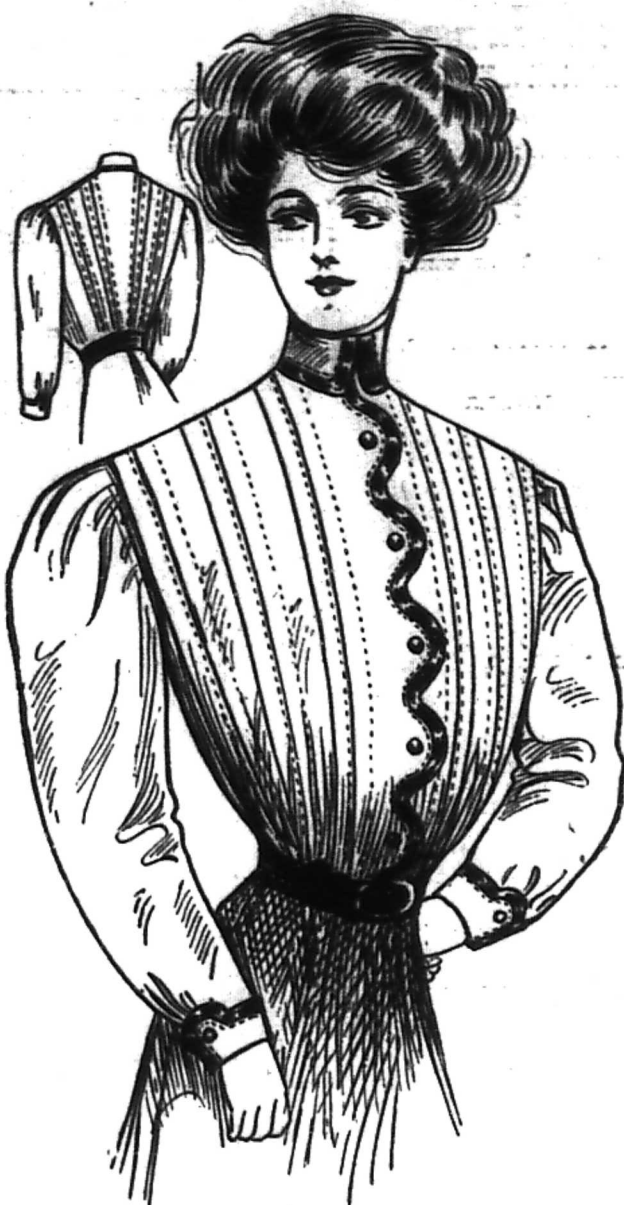
6097—Tucked Blouse, 32 to 42 Bust.