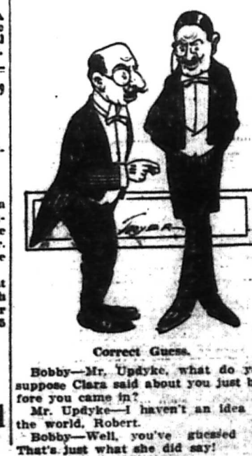
Correct Guess. Bobby—Mr. Updyke, what do you suppose Clara said about you just before you came in? Mr. Updyke—I haven't an idea in the world, Robert. Bobby—Well, you've guessed it! That's just what she did say!