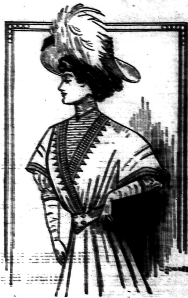
GIRLS OF VERMONT.

Fine white combined with checked buttons made of the willing could be used if preferred. The skirt was trimmed with a four-inch band of the checked fabric set on above the hem. This would be a very pretty one for any of the bodiced materials so much in vogue this season.