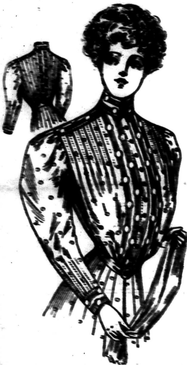
TRUED MEANS FOR BODICED MATERIAL USE.