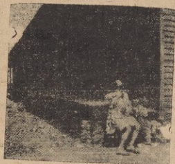
This is the street on which Eugene Williams, one of the Scottsboro boys, lived in Chattanooga. The children of the rich live in mansions. Eugene, forced to look for work, is framed on a charge of rape.