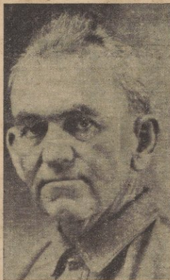
Tom Mooney, framed labor leader, has already served 14 years in jail. Only a wide protest movement will obtain his release.