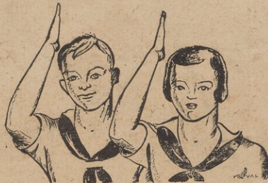
Children of workers, white and Negro, are joining the Young Pioneers, a workers' organization for children. Charlotte already has 75 members. How about Chattanooga?