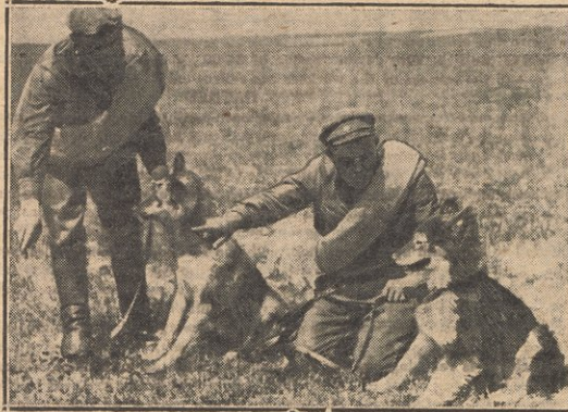
Soldiers of the Soviet Red Army, which is composed of workers and peasants ready to give their all for the defense of the first Workers' State.