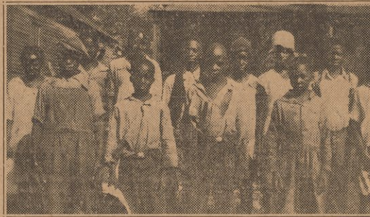
These Negro children, from 10 to 14 years old, work on ice wagons, in lunch counters, for stores. Most of them must be up at 4:30 in the morning. They are members of the Pioneer Group of Chattanooga.