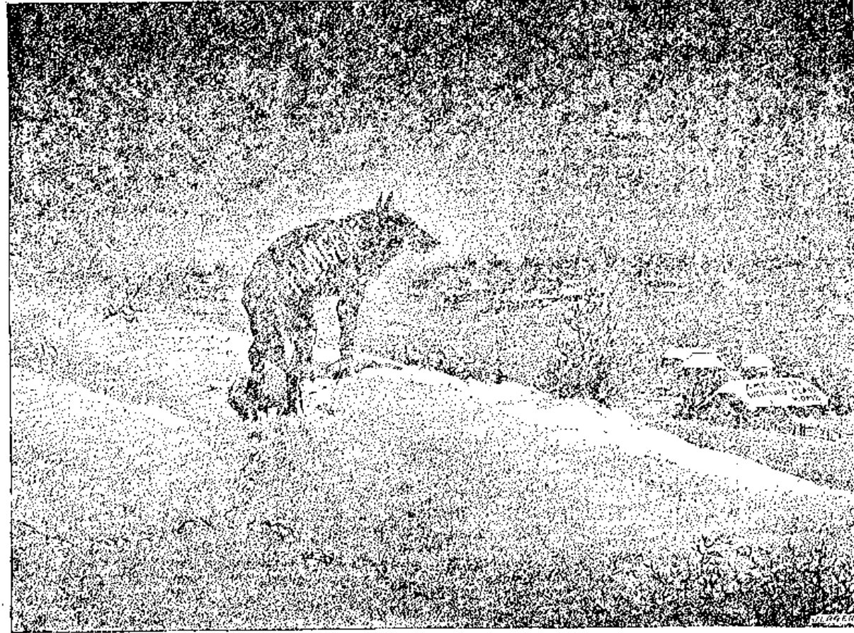
CHRISTMAS 1930—FOR THE WORKERS

WASHINGTON, Dec. 17.—The Senate Committee on Foreign Relations decided today by a vote of 10 to 9 to postpone consideration of the World Court protocols until December 1931.