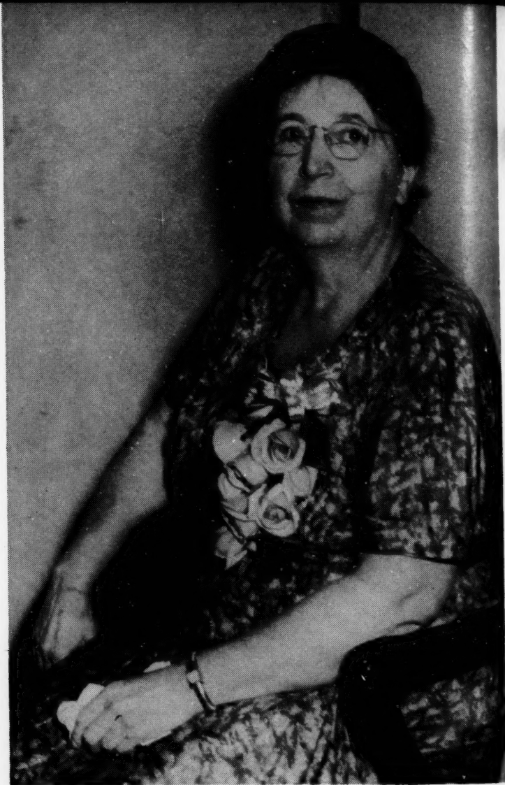
ELIZABETH GURLEY FLYNN NEWLY-ELECTED CHAIRMAN OF THE COMMUNIST PARTY, U.S.A.