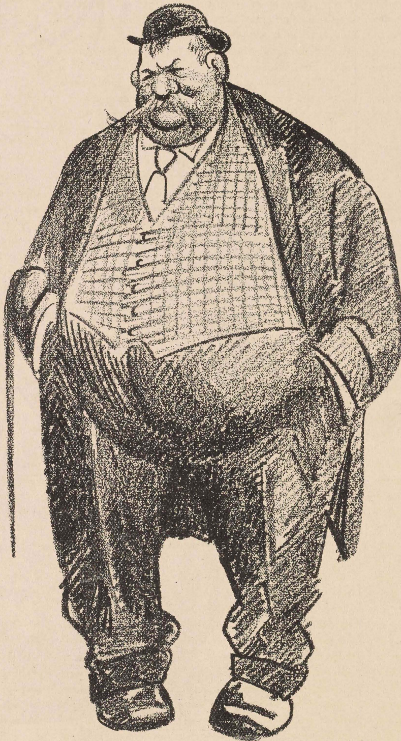
Drawn by Arthur Young.

To him it is like the struggle between the Athens of free men and Sparta with its rigorous militarism, subduing all things to the service of the State. His sympathies as a civilized man and a lover of beauty and freedom are with the modern exponents of the Idea of Pericles (cf. the "Funeral Oration").