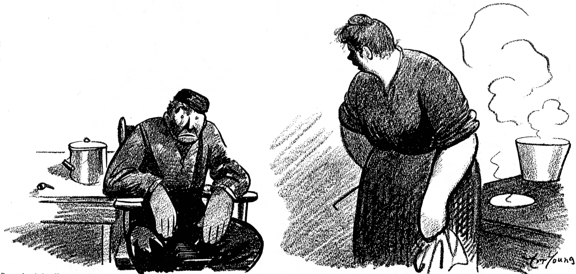
Drawn by Arthur Young.

"I GORRY, I'M TIRED!" "THERE YOU GO! YOU'RE TIRED! HERE I BE A-STANDIN' OVER A HOT STOVE ALL DAY, AN' YOU WURKIN' IN A NICE COOL SEWER!"