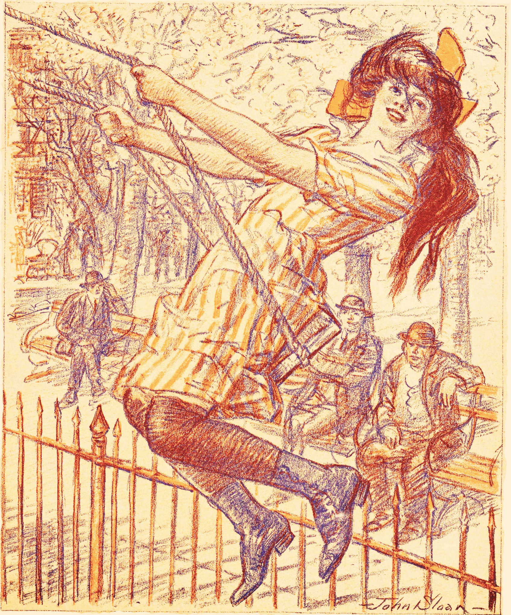
Drawn by John Sloan