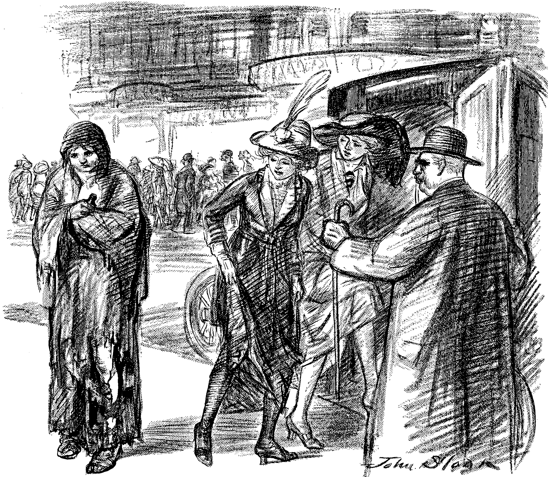
Drawn by John Sloan.