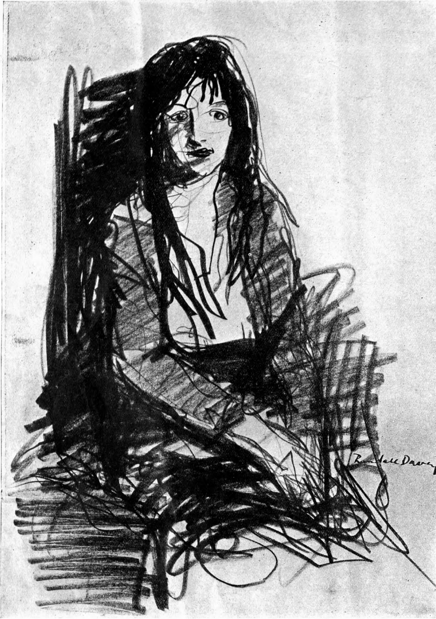
Drawing by Randall Davey

draughtsman, has a penchant for the popular that puts him in a class by himself. Few painters or cartoonists with his powerful qualities have been as popular as he. Hitherto high qualities in art and popularity have hardly been on speaking terms. Bellows has a picture in the exhibit which had it been drawn of a mediæval moralist would have won for the artist the leading part in a burning-bee in the public square. Think of picturing a moralist who according to his own report has scrutinized 3,984,063 obscene pictures and is out looking for more, and you will understand the magnitude of the task that confronted Bellows.