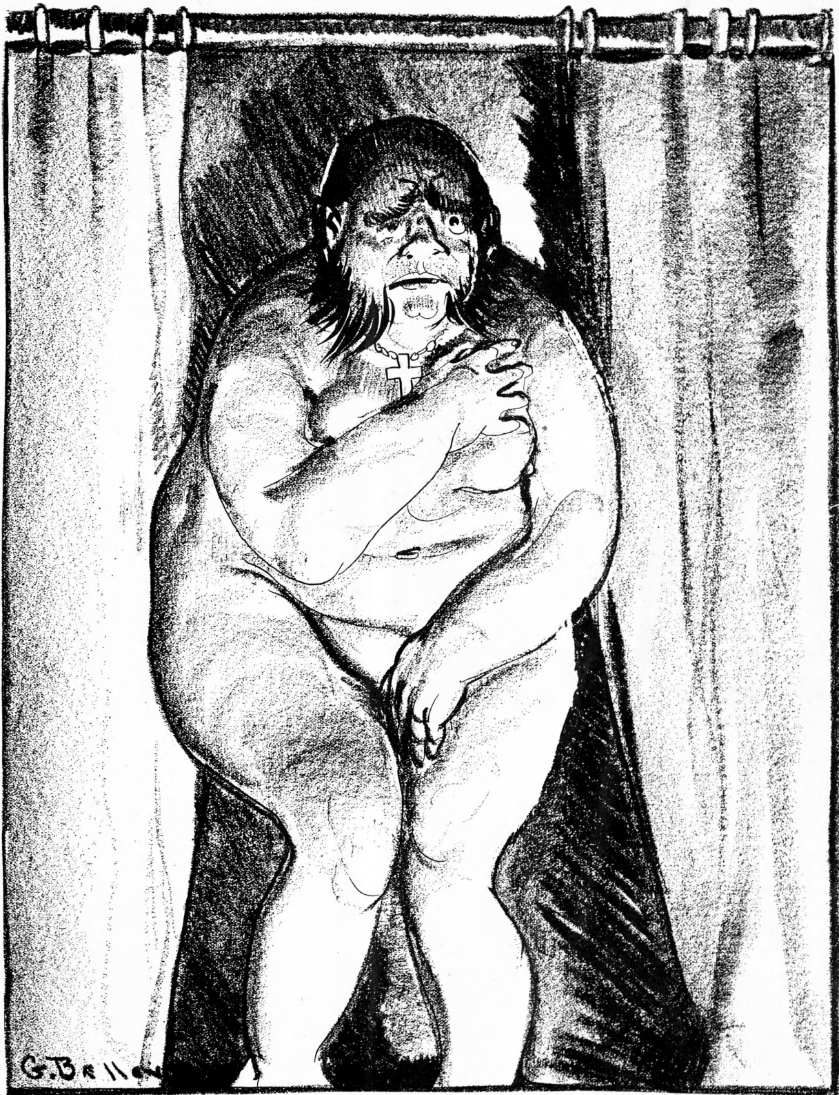
Drawn by George Bellows.