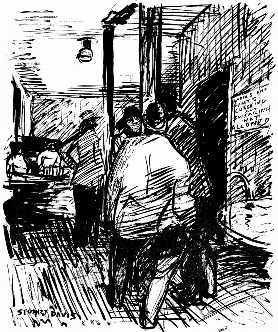
Drawing by Stuart Davis