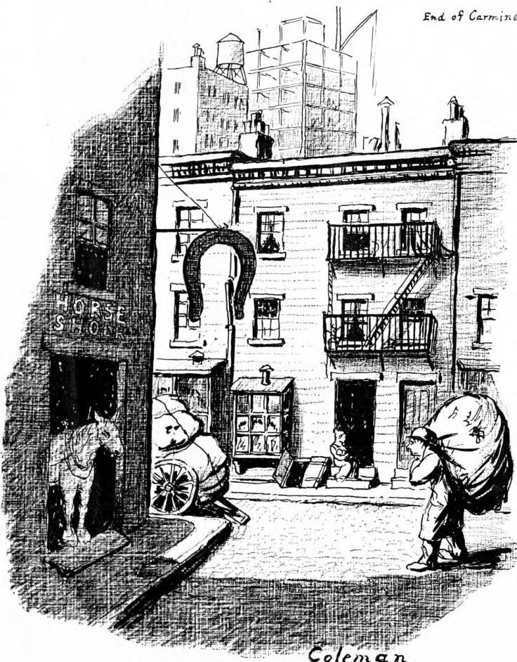
End of Carmine St

The doctor exhibited impatience, anxiety, restlessness. He talked over the head of the stupid bricklayer, in order to get rid of him. "Your daughter has contracted—er—something special, I should say, of a sort; of a sort. And a sort of spinal par-