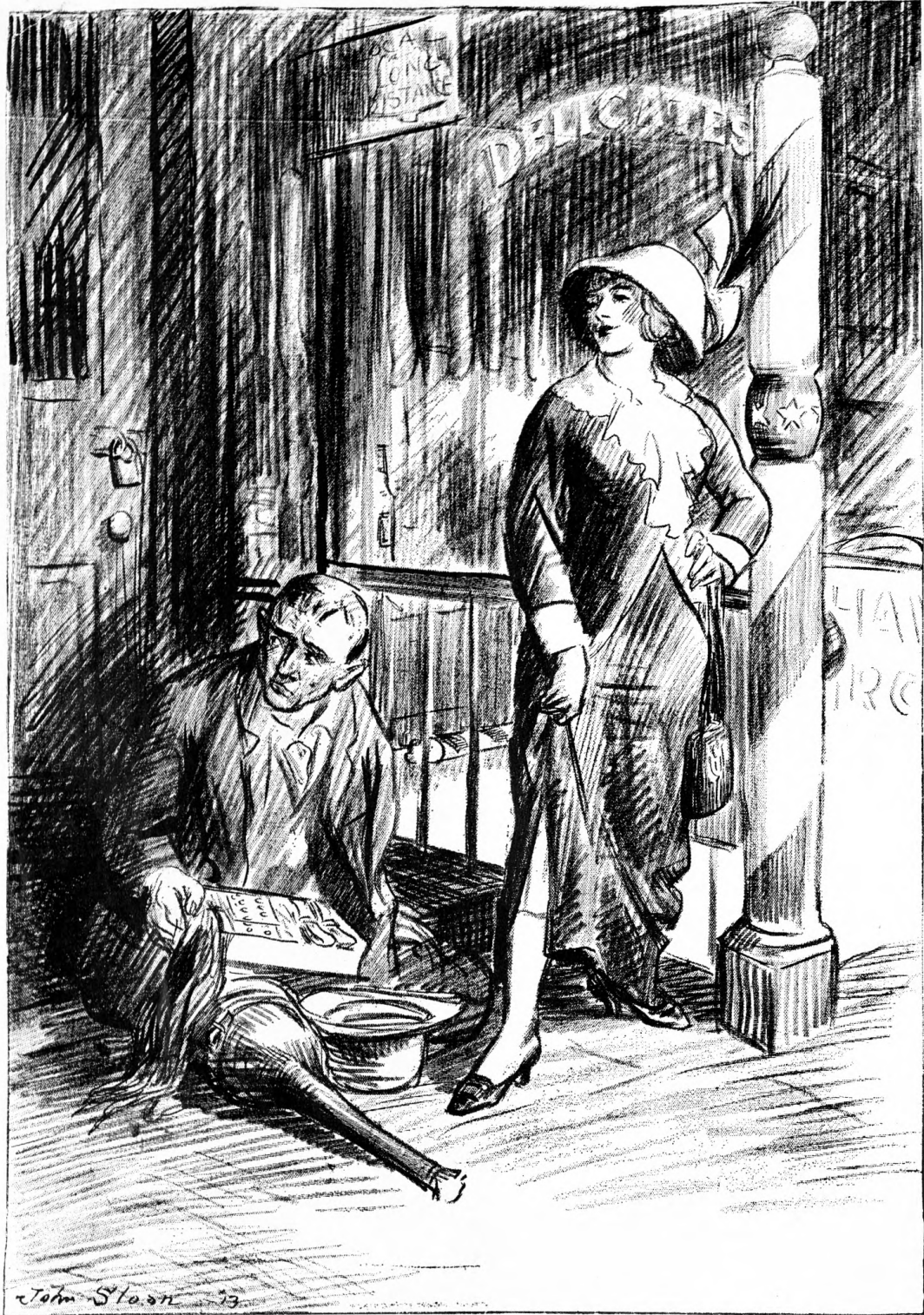
Drawn by John Sloan.