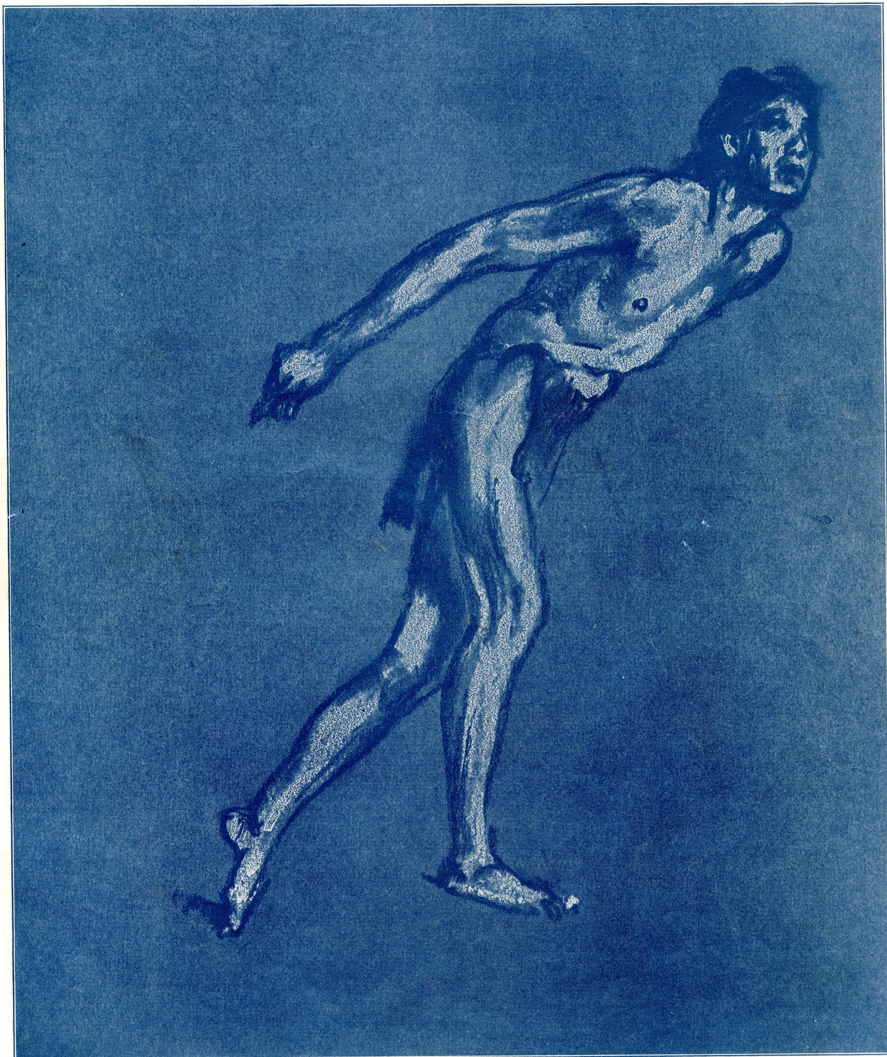
Design by Arthur B. Davies.