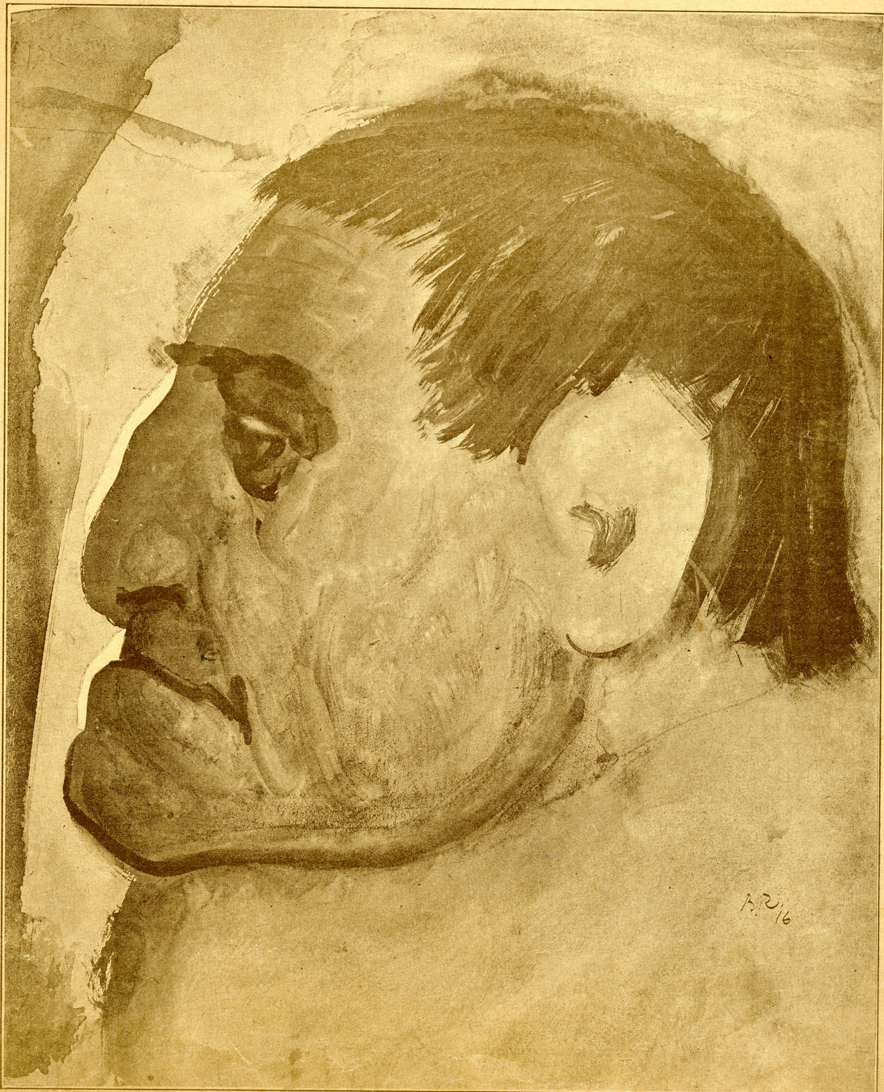
Drawn by Boardman Robinson.