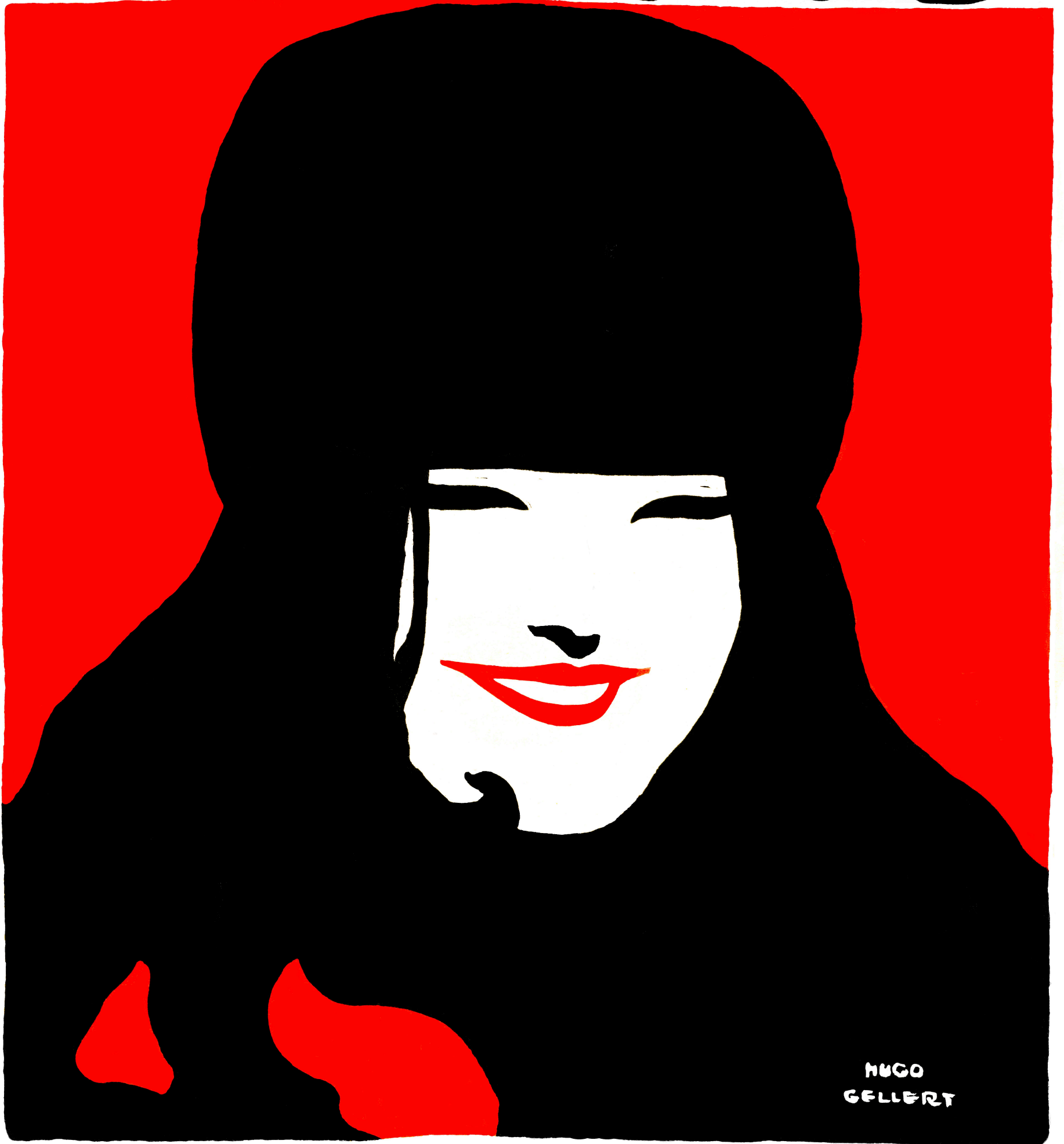
Drawn by Hugo Gellert.