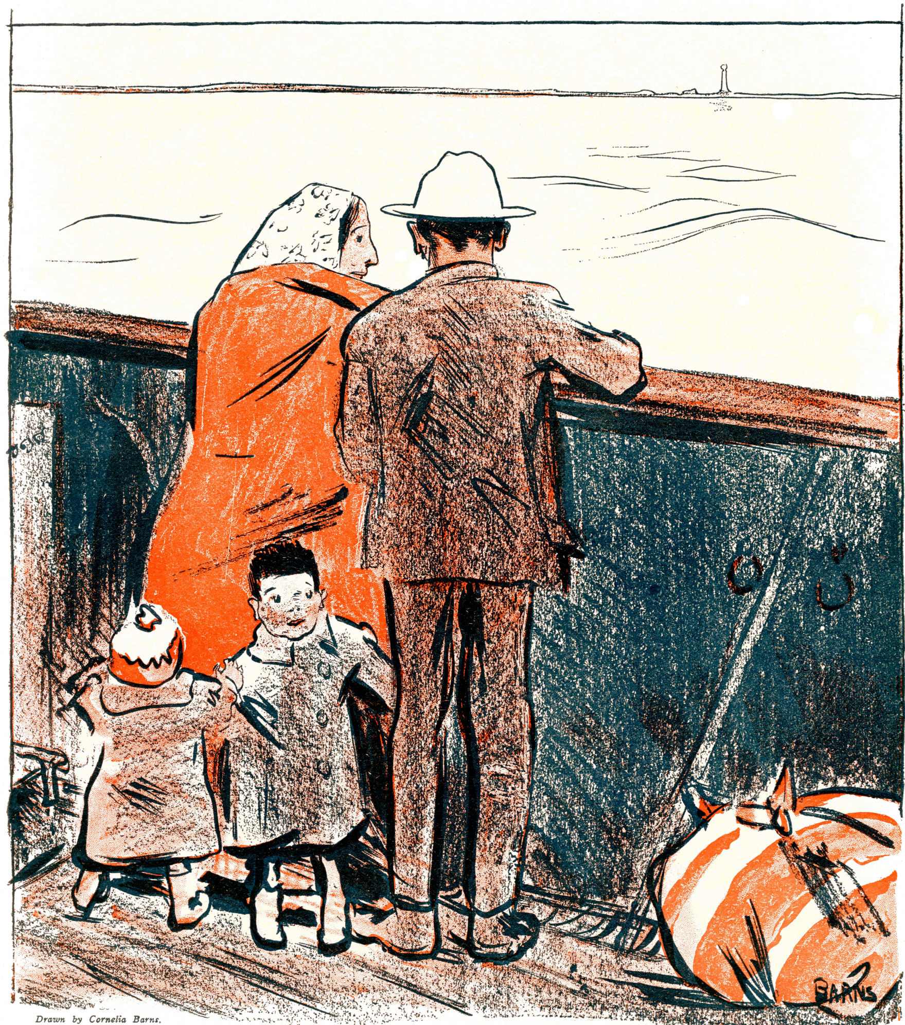
Drawn by Cornelia Barns.