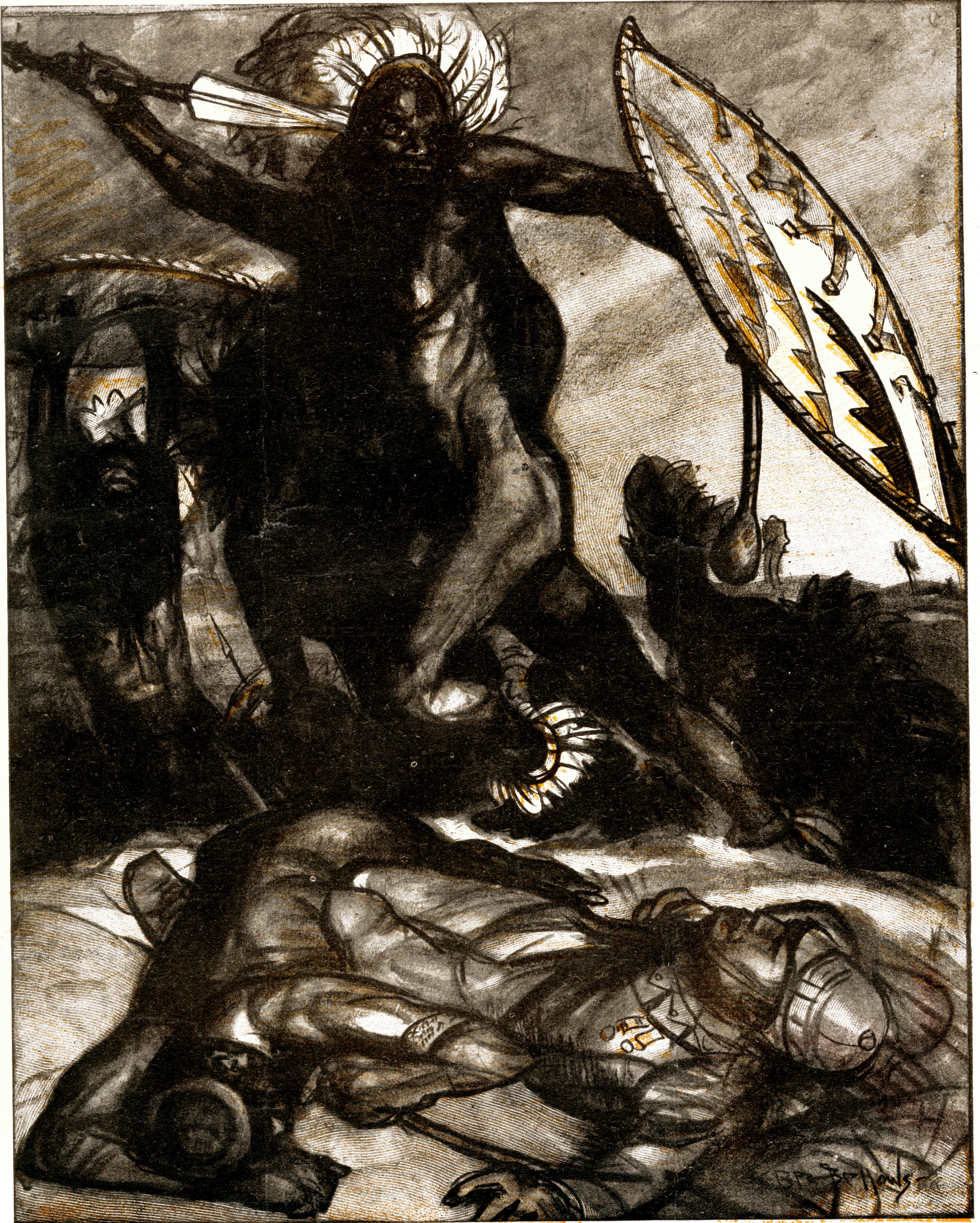
Drawn by George Bellows.