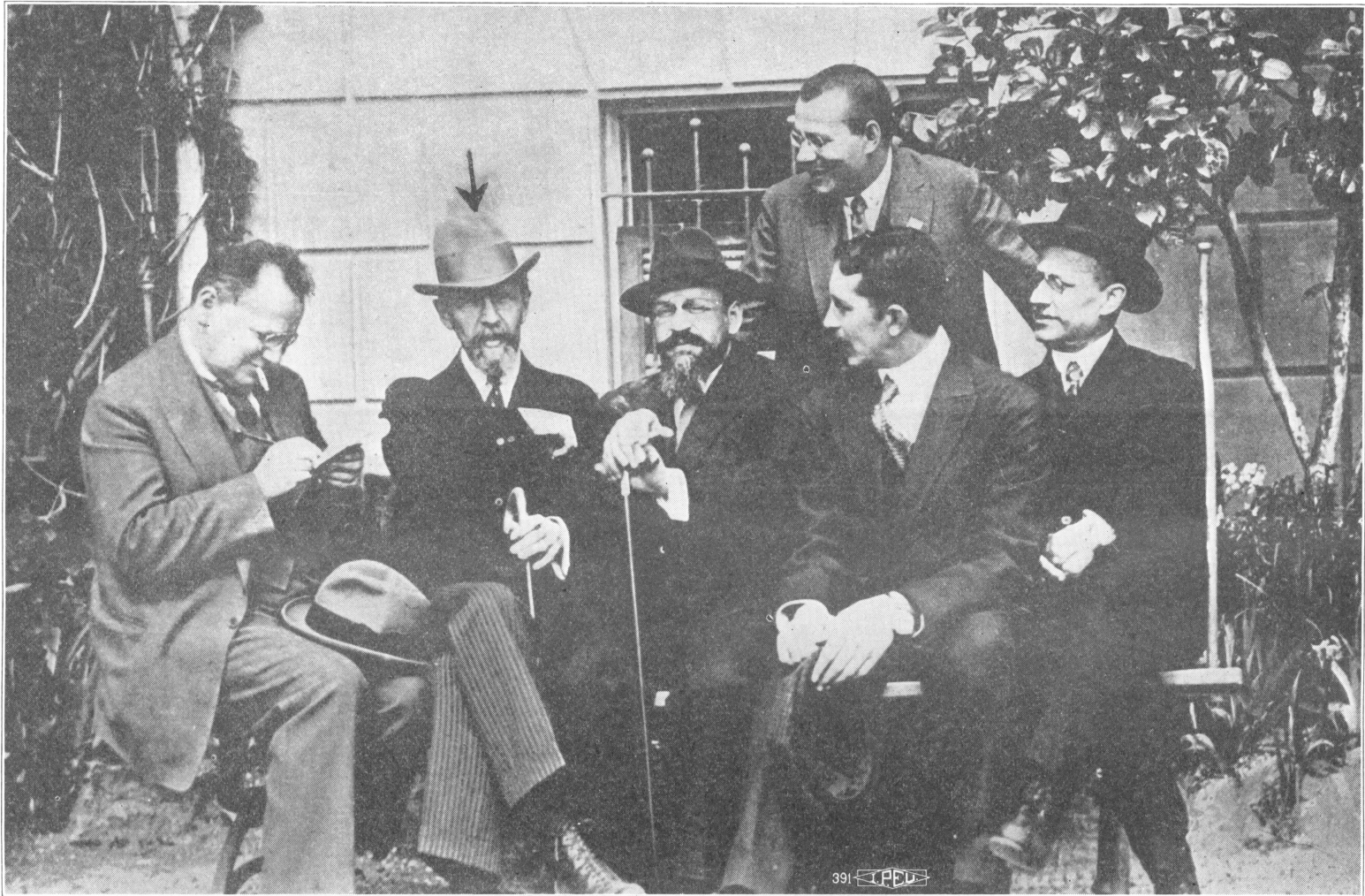
VASLOV VOROVSKY, ASSASSINATED SOVIET AMBASSADOR