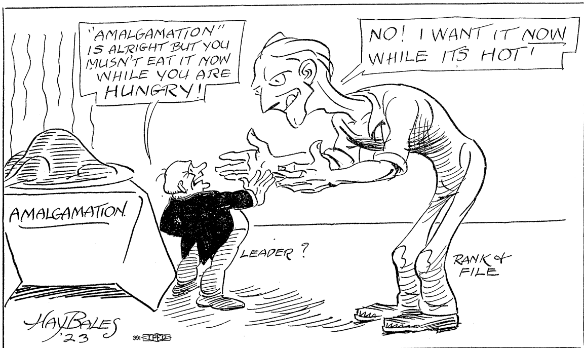
"AMALGAMATION IS INOPPORTUNE NOW"—Gompers

The fighting power of the building capitalists against the workers has been enormously increased within a short time. The introduction of