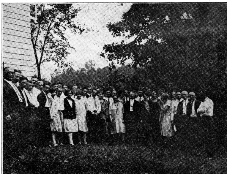
Textile Institute, Brookwood, 1927

S CHOOL days have come around again. Not merely for the maid in calico or her bashful barefoot beau, or the quick-stepping, high flying city youth. Workers are tackling the education of themselves. Their year of renewed work is also at hand.