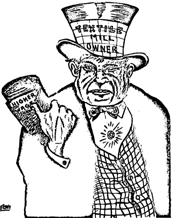
SOLIDARITY WILL GET THE GOODS