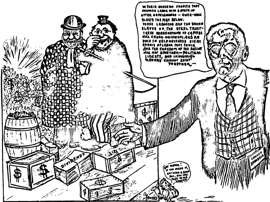
ANOTHER AGITATOR IN THE FIELD

Old Elbert Hubbard, He went to the cupboard, To find his "Philistine" an epigram; His brain-box was bare, So he tore out his hair, And he therefore inserted in lieu of the deficit two hundred blasphemies, five egotistical splurges, and little journeys enough to reach around the world. —The Nursery Rhymeter, in Satire.